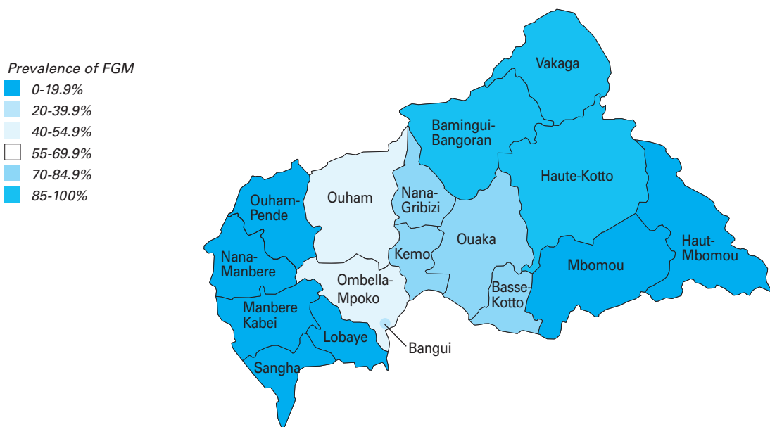
Map 2 - Central African Republic, 2000

The value of disaggregation by region or province is illustrated by the case of the Central African Republic (map 2), where data from MICS2 indicate that, at the national level, 36 per cent of women aged 15 to 49 have undergone FGM/C. Looking at the situation from a sub-national perspective reveals significant geographic variations. In five prefectures in the west of the country and two in the east, FGM/C prevalence