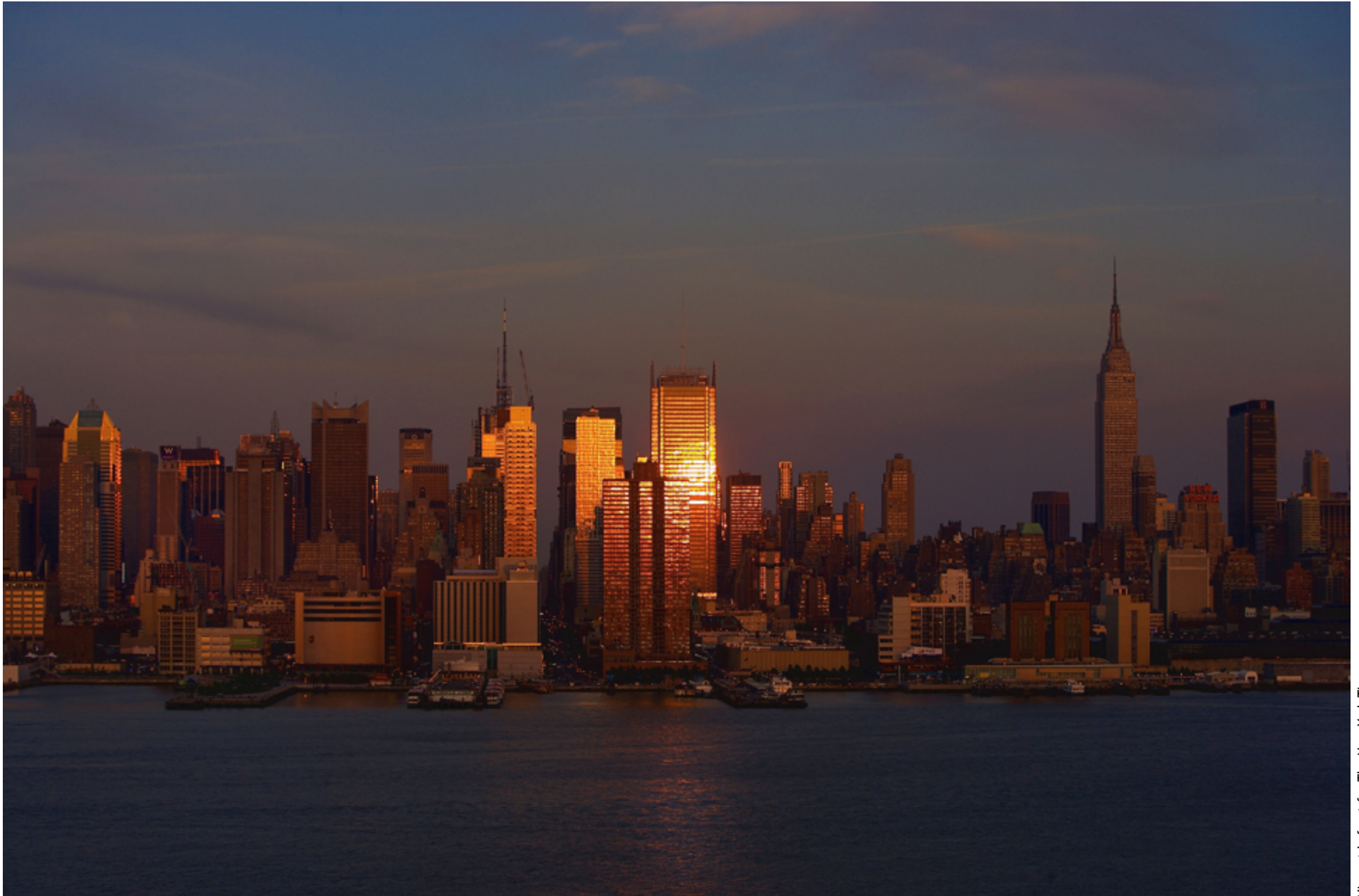
A view, from the east, of the 52-story New York Times Building at twilight