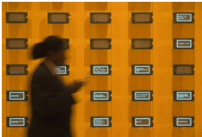
Two views of Moveable Type installed in the lobby of The New York Times Building during testing in September 2007.