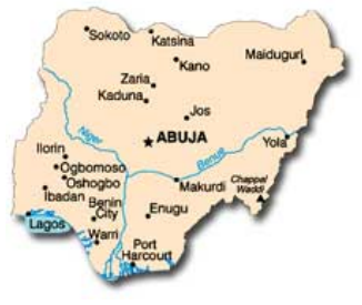
Click to Enlarge Image

Principal Rivers: Nigeria has two principal river systems: the Niger-Benue and the Chad. The Niger River, the largest in West Africa, flows 4,000 kilometers from Guinea through Mali, Niger, Benin, and Nigeria before emptying into the Gulf of Guinea. The Benue, the Niger's largest tributary, flows 1,400 kilometers from Cameroon into Nigeria, where it empties into the