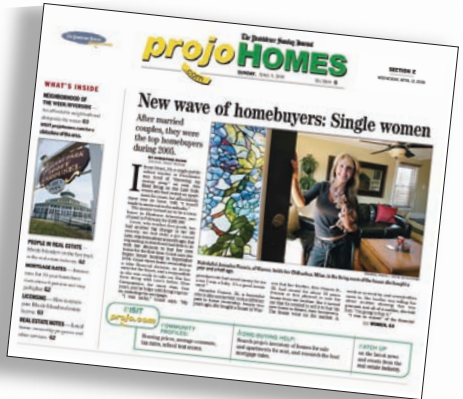
(In-paper Saturdays & Sundays)