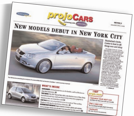
(In-paper Wednesdays, Saturdays & Sundays)

Facsimile: 401.277.8175 online at: projoCars.com