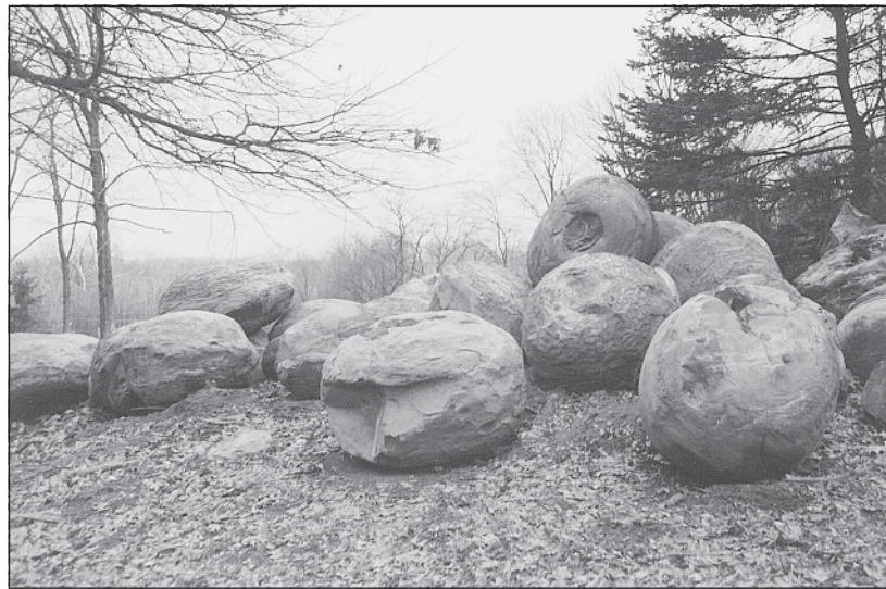
Pile of large "Huron boulders" excavated during construction of a road for a housing development on the west side of Olentangy River Road, Columbus. Several broken concretions revealed black, porous arthrodire bones in their centers. Note the funnel-shaped depression in the concretion at right center.

Large, spherical concretions are confined to the lower 50 feet or so of the Ohio Shale. High cliffs of Ohio Shale along such streams as Scioto Brush Creek in Adams County, Paint Creek in Ross County, Deer Creek in Pickaway County, the Olentangy River in Delaware and Franklin Counties, and the Huron River in Erie and Huron Counties have concretions embedded in the shale. The stream beds are littered with whole concretions as well as ones that have broken into large, angular fragments. The middle part of the Ohio Shale yields small (2-3 inches in diameter), ovoid, ironstone concretions that have a variety of fossils at their center. The upper part of the Ohio Shale has flattened, lenticular, carbonate concretions that commonly contain arthrodire bones; some contain exquisitely preserved remains, including soft tissue, of early sharks.