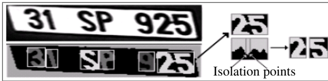
Fig. 4. Isolation of touching characters

In our implementation, we first apply the Gabor filter at three different scales (9, 11, 15 pixels) and in four directions ( 0^\circ , 45^\circ , 90^\circ , 135^\circ ) where large values indicate possible plate locations. We label each candidate plate region by using connected component analysis. Local vector quantization is applied over these regions. After local vector quantization, blob coloring process is applied to the quantized image to segment the characters and the segmented characters are labeled with different color.