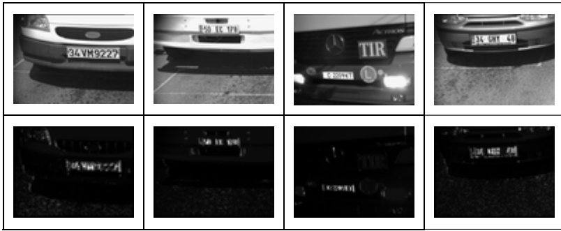
Fig. 2. Original images and normalized the Gabor filter responses.