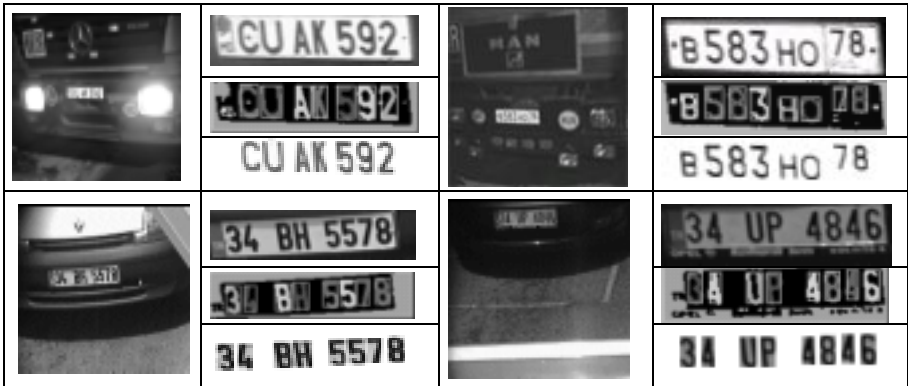
Fig. 5. Experimental results for five test images which include various sizes and forms of license plates.

Total computation time for a 512x384 pixels image was approximately 3.12 seconds on Intel® Pentium® 4, 1.4 GHz. The computation time depended on the image size and number of license plates in input image.