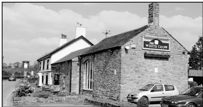
BIRD LIFE: The White Crow at Worthington