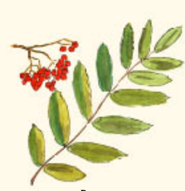
Rowan sprig and berries

Rowan, as a species tolerant of exposure, is often seen growing on field boundaries and around houses where it can be a useful provider of shelter. It is also a highly attractive tree, producing white blossom in the Spring and red berries in the Autumn. For this reason it is often grown as an ornamental tree in private gardens, along roadsides and in public parks. Rowan berries are traditionally used in the making of jellies and are fermented, yielding a drink not unlike perry. Rowan plays an important role as a native broadleaved species capable of growing on upland forestry sites and as such contributes to the maintenance and enhancement of biodiversity in these areas. As a small sized, light crowned tree, it is acceptable for public road side planting.