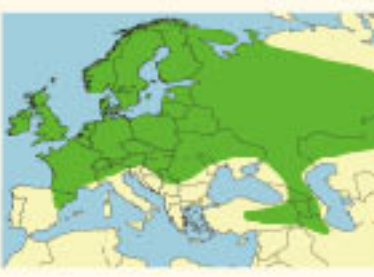
Natural distribution of rowan

Rowan is a native species to Ireland and the rest of Europe. It has an extensive natural range from Iceland across to western Russia and from Morocco in north Africa east to Turkey and northern Iran. It is also known in Ireland as mountain ash although it is not related to ash (Fraxinus excelsior), the only thing they have in common being a compound leaf arrangement. In some parts of Ireland rowan is known as quicken. It is found at higher elevations (up to 900 metres) than almost any other broadleaved species. Native Irish provenances of rowan are used and recommended for planting in Ireland.