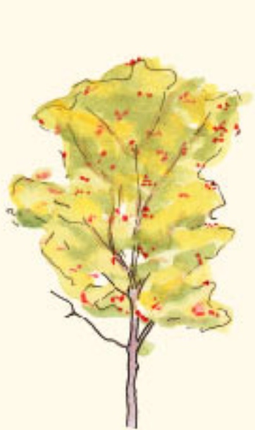
The rowan in autumn turns golden and has bright red berries

Rowan is not considered a commercial species in Ireland and is rarely planted in groups of greater than a few trees. Instead, it is usually planted in a scattered fashion, providing diversity of colour and texture to the landscape and so is unlikely to require pruning or thinning. Rowan does not grow to a very large size, rarely more than 15 metres when mature. It is a coppicing species which means that when cut, new shoots will develop from the exposed stump. Rowan is subject to browsing from deer and other herbivores.