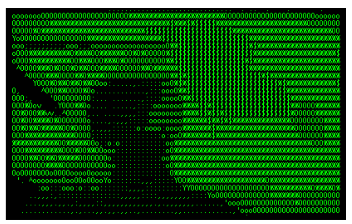
Figure 3.2. Shower scene from Psycho (Cosic, 2008)

Vuk Cosic's films and representations of famous scenes from film history in ASCII form, reveals the fact that digital movies are "frames made up from matrix of numbers" (Ibid.). According to Manovich, Cosic's works are "translating media content from one obsolote format into another. These projects remind us since at least 1960's the operation of media translation has been at the core of our culture" (Ibid. p. 277). Concluding his discussion on digital cinema and new media, Manovich states that "in computer age, cinema, along with other established cultural forms, indeed becomes precisely a code. It is now used to communicate all types of data and experiences; and its language is encoded in interfaces and defaults of software programs and hardware itself" (Ibid. p. 278). This transformation, offers new techniques to be exercised among many other transformations and remediations by computerization.