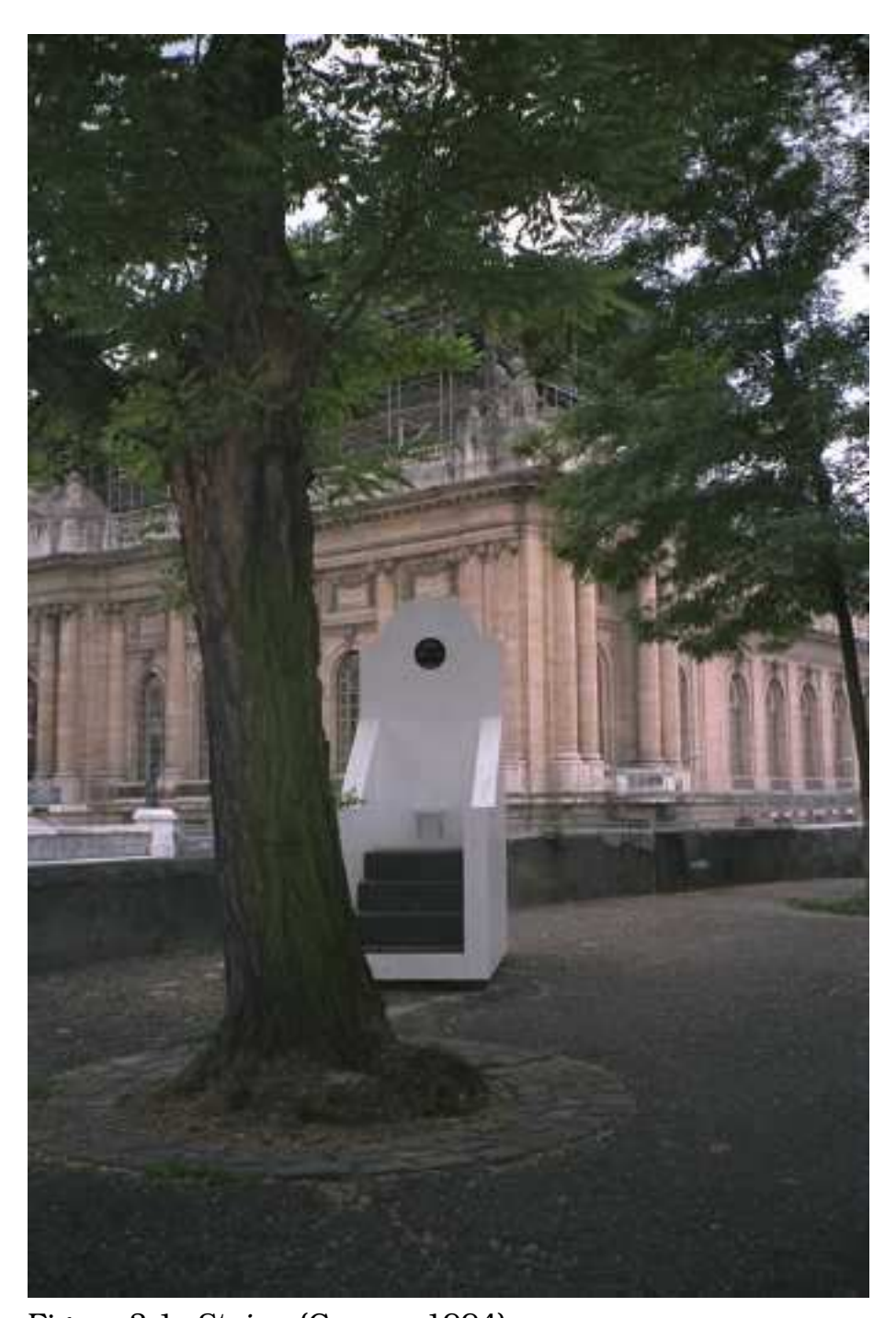
Figure 3.1. Stairs. (Gevrey, 1994)

Manovich, calls this installations as examples of spatial database form of narrative, where the spectator is able to follow a narrative by walking from one screen to another (Manovich, 2001b, p. 209). This three-dimensional representation of the cinematic narration of Greenaway,