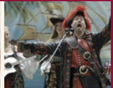
2006 PIRATES INVADE THE WATERFRONT VILLAGE