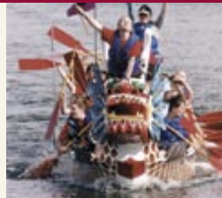
1989 DRAGON BOAT RACES BEGIN