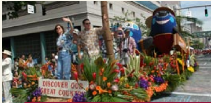
PARADE FLOATS ARE COVERED WITH NATURAL MATERIALS, LIKE FLOWERS AND SEEDS