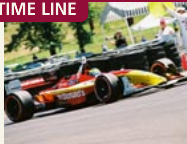
1984 INDY-CAR RACING COMES TO THE PORTLAND ROSE FESTIVAL