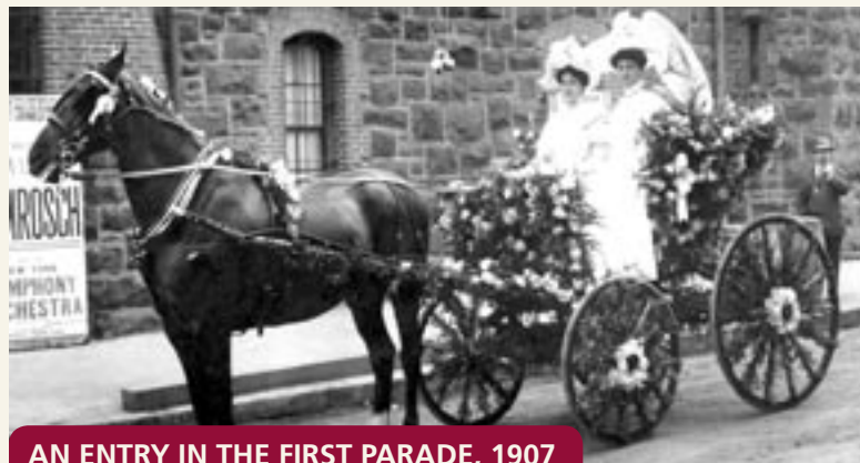
AN ENTRY IN THE FIRST PARADE, 1907

Two years later, in 1907, the Portland Rose Festival began. There was a children's parade and a floral parade and a rose show, just like there is now! People cut flowers from their yards to put on the parade floats. The next year, in 1908, the Rose Festival had an electric light parade. This was very exciting because electricity was new. A king ruled over the Rose Festival. His name was Rex Oregonus. "Rex" means king in Latin. What do you think "Oregonus" means?