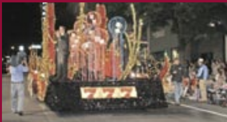
1976 STARLIGHT PARADE BEGINS