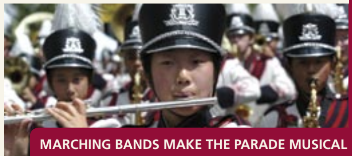
MARCHING BANDS MAKE THE PARADE MUSICAL