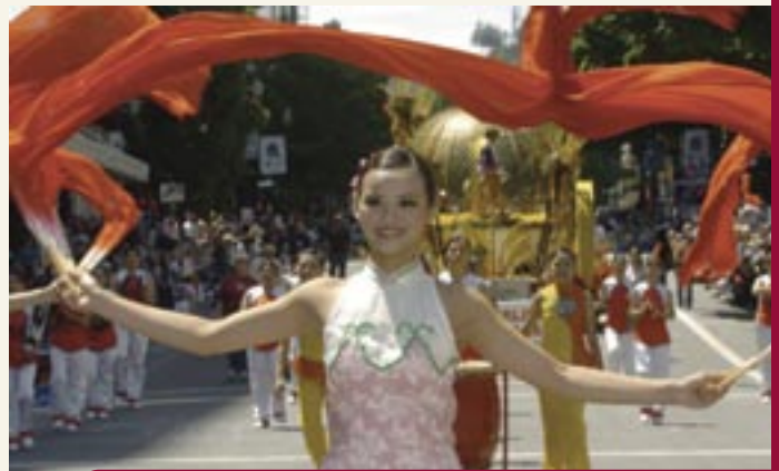
KIDS FROM KAOHSIUNG JOIN THE PARADE

Next year will start the second hundred years of the Portland Rose Festival. Some new things will be added to the festival. Some parts will stay the same. In the future, perhaps we will have floats that float in the air! Maybe the crowd will call in a vote for the best band. What do you think the Portland Rose Festival will be like when it has its 200th birthday?