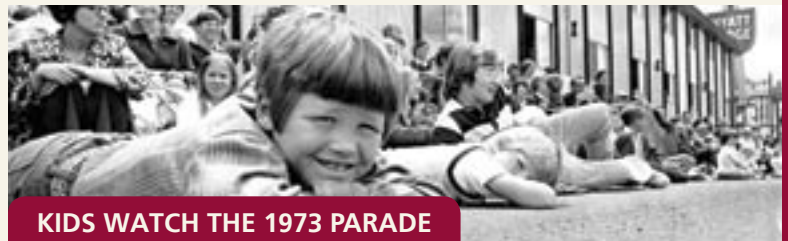
KIDS WATCH THE 1973 PARADE

Can you find other Rose Festival events on the time line? What year did someone fly a biplane off a downtown building? When did the Starlight Parade begin? When did pirates become a part of the Waterfront Village?