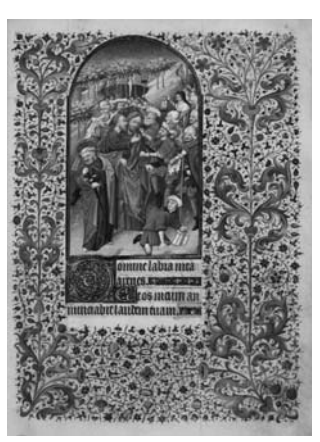
The Wardington Hours.