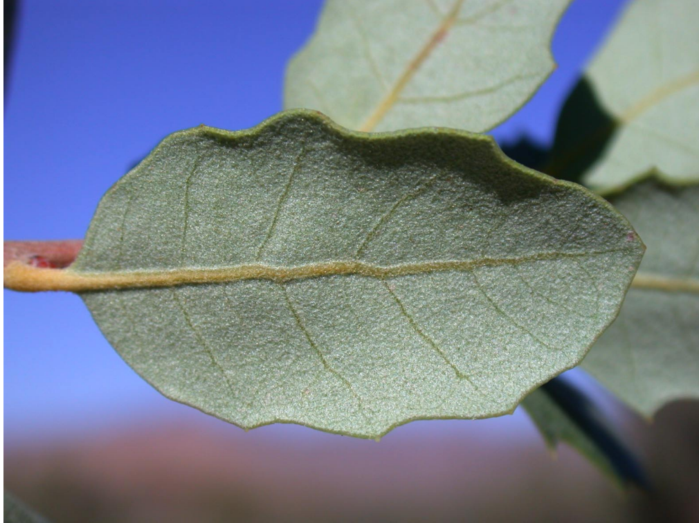
Figure 8 — Quercus cornelius-mulleri , typical leaf, with dense whitish trichomes on lower surface. Photographed near Banner, San Diego County.

Like other California scrub oaks, Q. cornelius-mulleri probably is related to a group of lobed-leaf species of white oak. A likely candidate, based on vestiture of the leaves, fruit and cup form, and papery bark characteristics, is the species group that includes the species Q. sinuata , Q. pungens and Q. vaseyana , with a distribution from the southeastern U.S. to Arizona and northern Mexico. However, Q. cornelius-mulleri also shares certain features with Q. lobata , in particular the large tapered acorns, and a relationship with that species cannot be excluded.