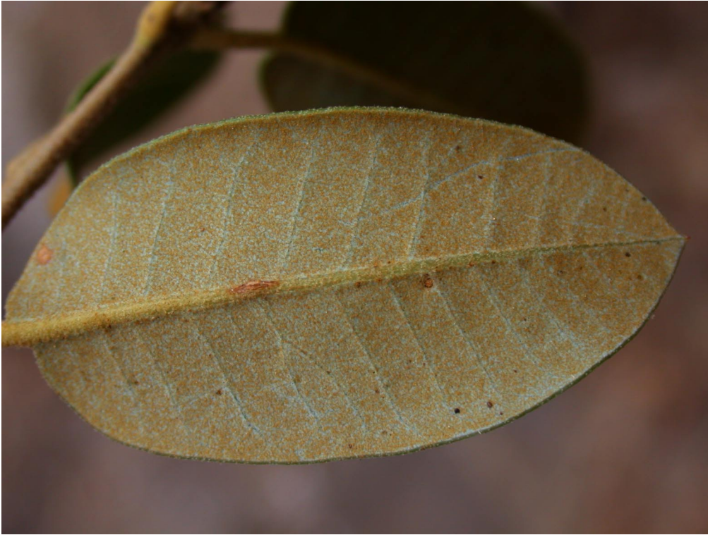
Figure 4 — Quercus chrysolepis , lower leaf surface of young leaf, with glandular hairs. Palomar, San Diego County.

Quercus palmeri —Much confusion surrounds the correct name for this species, which in some of the older literature was called Quercus dunnii . The latter name was proposed by Kellogg only as a provisional name, and is not valid under the rules of nomenclature. Although Q. dunnii was later accepted by the author, in the meantime Q. palmeri had been published as a species and therefore it is the oldest valid name for this species. Q. palmeri is a rarely encountered species in southern California, and is more common in parts of Central and Western Arizona, and in Baja California, Mexico. This bimodal Arizona-Baja California distribution may indicate a preference for summer rains, and explain the spotty California distribution as mostly due to attrition with an increasing Mediterranean climate. The leaves of Q. palmeri are among the spiniest of any oak species, and the species produces thickets that are virtually impenetrable by large mammals such as humans.