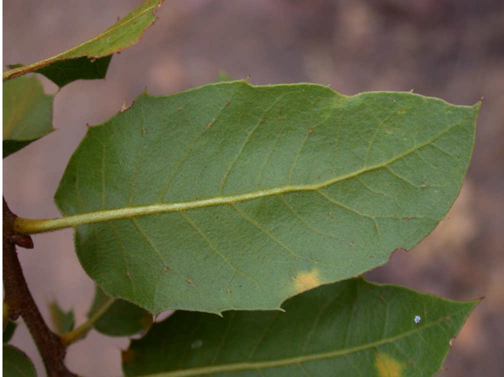
Figure 1 — Quercus wislizeni , typical leaf from lower side. Palomar, San Diego County.

habitats interdigitate more freely due to lower elevations in the Coast Ranges than occur to the south. In southern California, from the Transverse ranges south, Q. wislizeni does not typically attain tree stature, and usually has numerous trunks. These populations appear to be genetically distinct and separable as Q. wislizeni var. frutescens . It should be noted, however, that various individuals and small populations of Q. wislizeni var. wislizeni , particularly in the foothills of the Sierra Nevada, may have a scrubby form, which seems more environmentally induced.