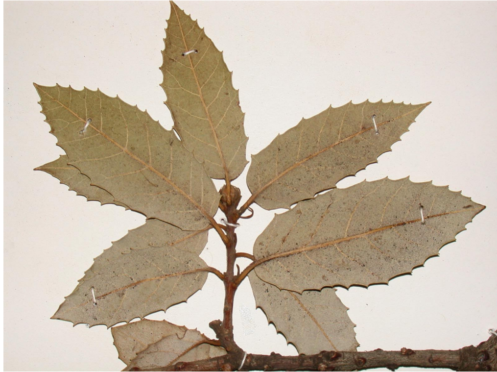
Figure 3 — Quercus tomentella , specimen from type locality, Guadalupe Island, Mexico (Cerde 2, MEXU).

Quercus tomentella — Quercus tomentella , the “Island Oak” is restricted to the larger Channel Islands, and also is found on Guadalupe Island off the coast of Baja California, Mexico, the type locality for the species. It is a tree species that resembles Q. chrysolepis in general form, but has larger, thicker leaves with more prominent regular teeth and a somewhat corrugated leaf blade (fig. 3).