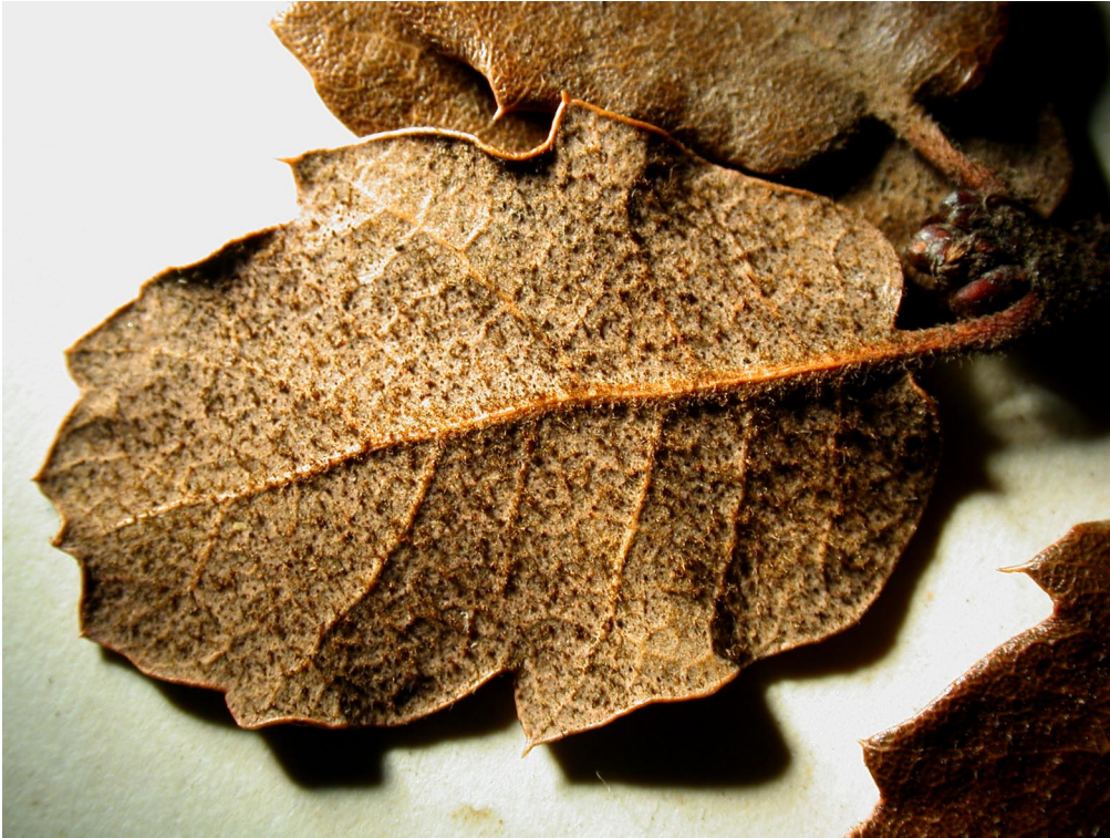
Figure 5 — Quercus dumosa , lower leaf surface, and sublobate form. Specimen from 32 km north of Ensenada, Baja California Norte, Mexico (Wiggins & Gillespie 3999, MEXU).

characters are significant in the context of oak systematics, and populations bearing these characters are found only in very restricted habitats in low hills near the coast, often on very loose sandstones or granitics, in association with species often referred to as “soft chaparral,” as opposed to the “hard chaparral” habitat of Q. berberidifolia in higher and more interior localities. One of the most distinctive features of the species is an erect, usually twisted, multi-rayed trichome on the lower leaf surface (fig. 6), unlike any other scrub oak. Q. dumosa sensu stricto is perhaps one of our rarest and most threatened species, known only in these coastal habitats from Santa Barbara County south to northern Baja California. It is unknown from the Channel Islands. Many of the habitats where Q. dumosa would be expected have been destroyed by development, and represent some of the most expensive and desirable real estate in southern California. Because of the former wider application of the name Q. dumosa , there probably has been some confusion and resistance regarding the rare status of this species. Anyone doubting the distinctness of the species is encouraged to visit Torrey Pines State Park, in San Diego County, one of the last remaining populations that is relatively intact and accessible.