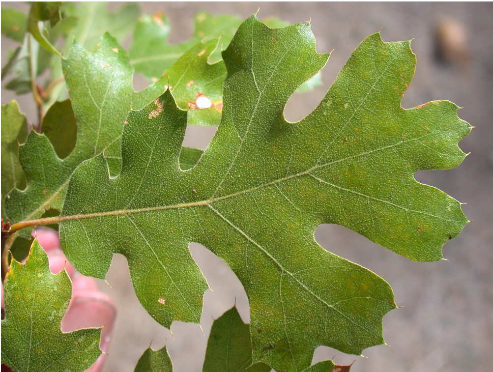
Figure 2 — Quercus kelloggii , typical leaf from above. Palomar, San Diego County.

Quercus kelloggii — Quercus kelloggii , the California black oak, is a winter-deciduous species with deeply lobed leaves reminiscent of the lobed-leaf red oaks of Eastern North America (fig. 2). It is mostly restricted to higher elevations, except in the north Coast Ranges. No particular eastern species of lobed-leaf oak is particularly close to Q. kelloggii in morphological features, and its overall relationships must await further study.