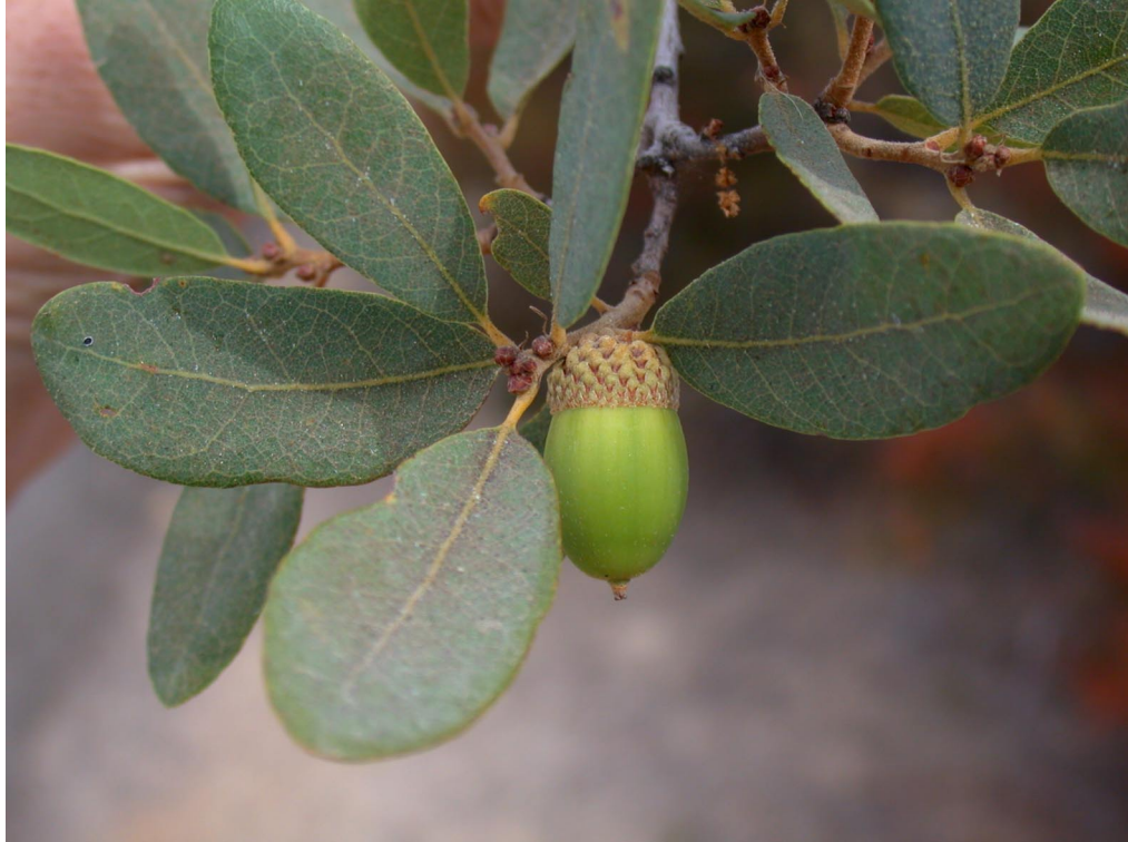
Figure 9 — Quercus engelmannii , branch with acorn. Photographed near Palomar, San Diego County.

The complex of species to which Q. engelmannii belongs (subsection Glaucoideae) generally occurs in relatively arid areas that receive most rainfall in the summer months. These localities, from the southwestern U.S. to southern Mexico, are some of the driest places that oaks are found in North America. Additionally, the embryological features separating this group are associated with a germination syndrome in which the embryo axis is placed more deeply into the soil, and may be an adaptation to drought, fire, or both (Nixon 1984). Further study of the ecology of the unusual germination syndrome of this group, including Q. engelmannii , is needed.