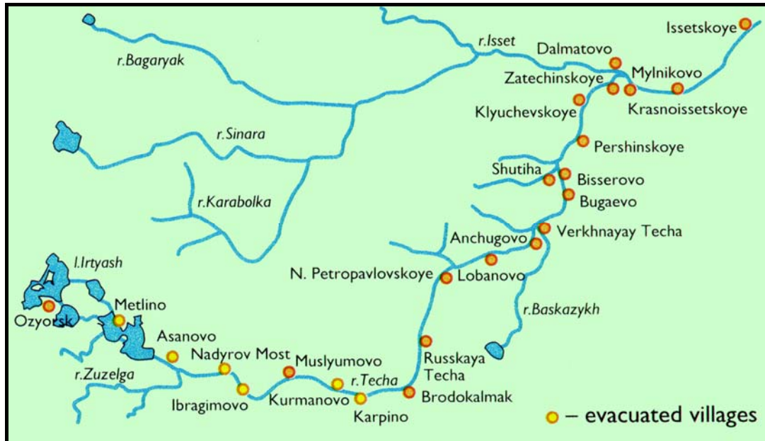
Figure 2. Villages along the Techa River that were evacuated due to radioactive discharges from Mayak PA (JNREG, 1997).