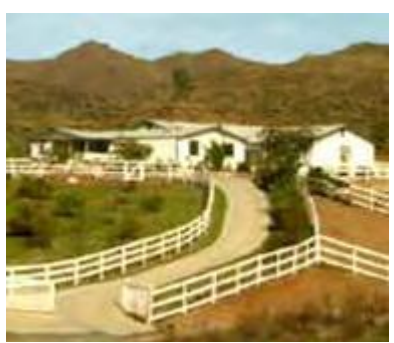
Rancho de la Paz

ADDRESS: PO Box 1388, Lake Elsinore, CA 92530