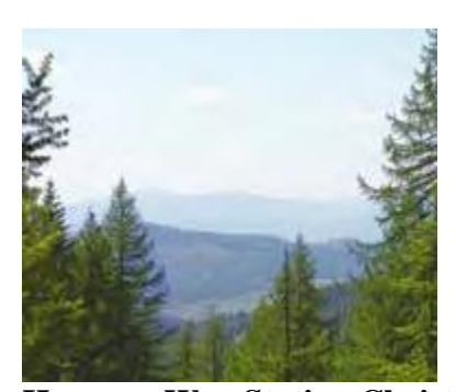
Hosanna Way Station Christian Retreat Center

Camp Berachah is 40 minutes from Seattle, nestled in the foothills of the Cascades. Enjoy over 150 acres of trees and trails with deluxe lodge rooms or RV sites. Owned and operated by Camp Berachah Ministries, an independent evangelical Christian non-profit organization. We are always happy, based on availability, to host restful retreats for pastors and Christian workers.