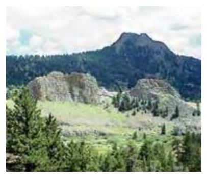
CrossRoads Counseling of the Rockies

ADDRESS: PO Box 4767, Buena Vista, CO 81211