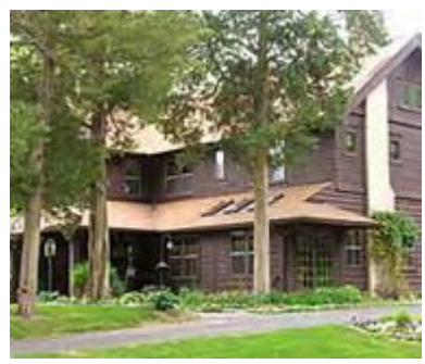
Pastors Retreat Network

ADDRESS: PO Box 180455, Delafield, WI 53018