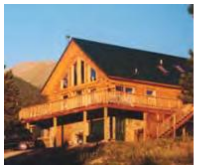
Shining Mountain Ranch

Guests have the entire lower floor to themselves during their stay with use of the media room, piano, games, the pool table, and the hot tub outside. A large library of music or message tapes and CDs, books, and over 700 videos and DVDs are available to enjoy. Breakfast is served in the formal dining room at the time agreed upon by the guests and is the only meal provided, but substantial enough to last until dinner. Guests may choose from many local restaurants for dinner.