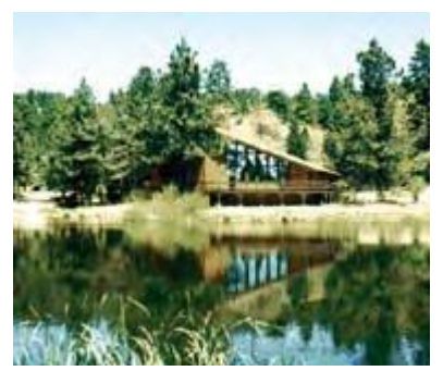
Pinecrest Christian Conference Center

Genesee Home is a ministry that provides a place for pastoral couples and missionaries to restore their souls, refresh their relationship with God, rekindle their personal love, and renew their hearts for ministry. We are located on a 1,600-acre working cattle ranch in the northern Sierra's of California. Genesee Home is a restored 1881 Victorian home. There are five lavish bedrooms each with their own bathroom, a special prayer barn, extensive library and space to be quiet with your spouse and Jesus Christ. This is a Sabbath Week retreat that will encourage you in ministry and strengthen your marriage.