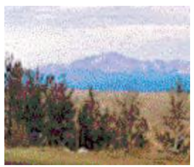
Stone Gate Resources

ADDRESS: 11509 Palmer Divide Road, Larkspur, CO 80118