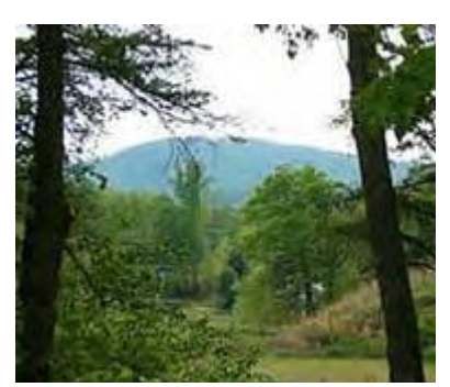
The Father's Heart Ministry

Shepherd's Refuge, located on 80 wooded acres in the North Georgia Mountains, offers a place of rest and relaxation to pastors, church leaders and missionaries. Until the cabins are completed, accommodation is available B&B style in Shepherd's Lodge and is limited to a one-week stay to allow others to benefit. Although we love children, the primary focus is for individuals and couples to enjoy an intimate time with the Lord and with each other. The ministry is located near Dahlonega, Cleveland, and Helen, with opportunities to shop, sightsee, golf, hike, fish, and much more. Shepherd's Lodge is overlooking a peaceful valley and offers walking trails and benches that invite you to come rest a while.