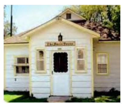
The Marie House

ADDRESS: 202 Broadway, Naponee, NE 68960