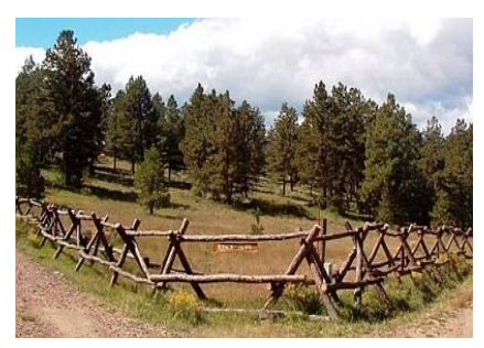
Ranch of Hope

ADDRESS: 2283 County Road 323, Westcliffe, CO 81252