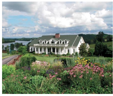
Whitestone Country Inn

Within easy driving distance are many activities—hiking, white-water rafting, horseback riding, swimming and boating, world famous Rhododendron gardens, antique shopping, and sightseeing.