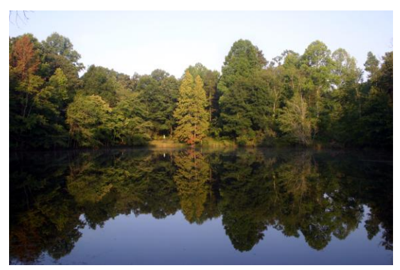
Healing Springs Retreat Center

ADDRESS: 83 College Heights Rd, Franklin Springs, GA 30639