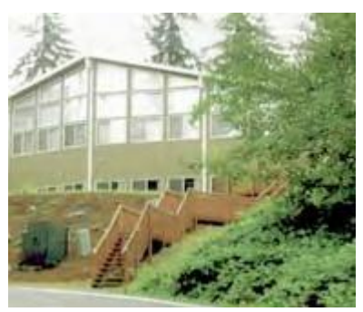
Camp Berachah Ministries

ADDRESS: 19830 SE 328th Place, Auburn, WA 98092