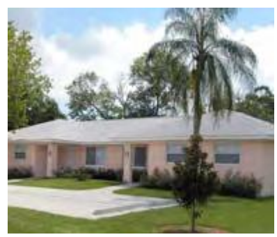
D&D Missionary Homes, Inc.

(www.besidestillwaters.wordpress.com/). The program costs range from $130-$225. At this time, maximum stay is 10 days (January-August), or 14 days (September-December). Program not open to groups. Maximum number of guests is 6 per unit. One unit per booking unless immediate family (children under 18) numbers more than 6, then additional unit may be booked if available, and additional fees will be charged. Please note: 501(c)3 IRS paperwork for your church is required. Please see website for more information on the program requirements.