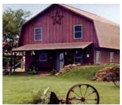
Buffalo Ridge Hospitality & Retreat Center

MAILING ADDRESS: PO Box 400, Ottawa, KS 66067