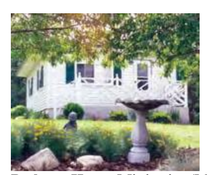
Bethany House Ministries (Meadows of Dan, Virginia)

CONTACT ADDRESS: P.O. Box 14853, Greensboro, NC 27415