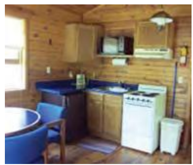
Cedar Creek Retreat Center

ADDRESS: 3549 E. 25th Rd., Marseilles, IL 61341 (near I-80 and I-39) PHONE: 1-877-833-2272 (reservations); 1-815-496-9481 (information)