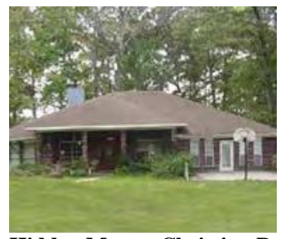
Hidden Manna Christian Retreat Center

ADDRESS: 26203 Oak Ridge Dr, The Woodlands, TX 77380