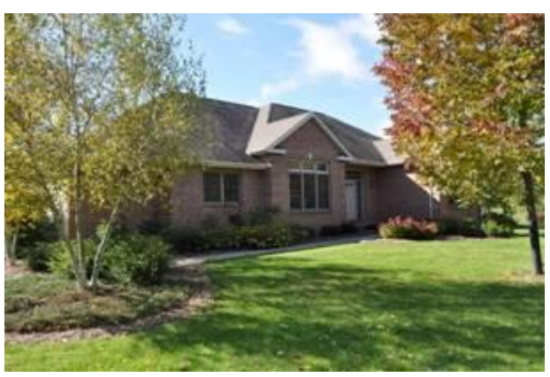
Deer Ridge Ministries

MAILING ADDRESS: 401 Meadows Street, Polo, IL 61064. Retreat Location: Freeport, IL