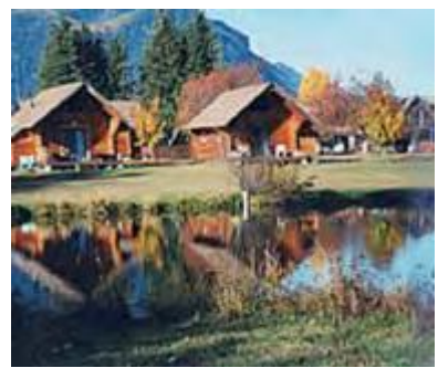
Diamond T Ranch

ADDRESS: 5361 River Road, Clark Fork, ID 83811