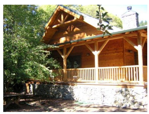
The Brook Lomond Cabin

If personal ministry is desired, cost is up to 10 hours per week by arrangement, at $30 per hour. Housing is available for up to two weeks. Closed during July, August, and December.