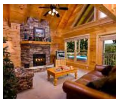
Cozy Bear Cabins

ADDRESS: Pigeon Forge, TN PHONE: 1-800-835-6780