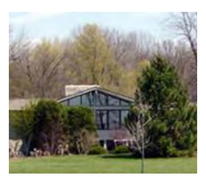
Innkeeper Ministries, Inc.

ADDRESS: 6701 Lewisburg-Ozias Rd, Lewisburg, OH 45338