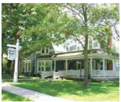
Christian Hospitality Network (CHN)

A network of over 1000 national and international participating lodging properties.