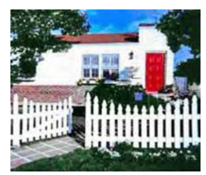
The Cottage on Coronado Island

Amenities include : Breakfast, afternoon hors d'oeuvres, hairdryer, bathrobes, iron & ironing board, CD/Tape player, piano, extensive library, DVD player, wide screen TV, internet access, and complimentary concierge services. Outside: Seating throughout the property, horse shoes, and a fire pit. For a fee we can provide an airport shuttle.