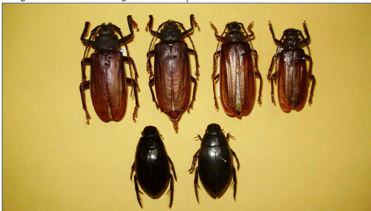
Top left. A pair of Paroplites australis . The male is on the right. Note ovipositor protruding from the tip of the female P. australis abdomen.

Paroplites australis can attain 55 mm in length with males typically being longer and more heavy limbed than females. Adults emerge all at once on hot, humid nights in late January and February.