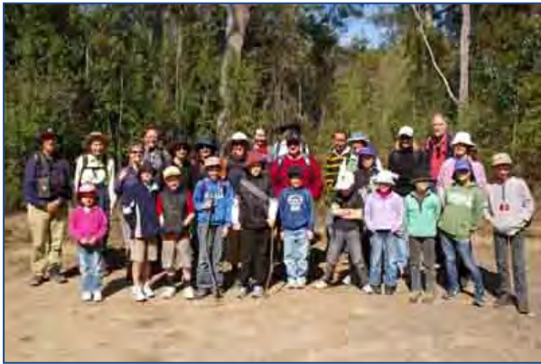
A keen group of Field Nats

This day was thoroughly enjoyed by everyone. Thanks to all who made it possible.