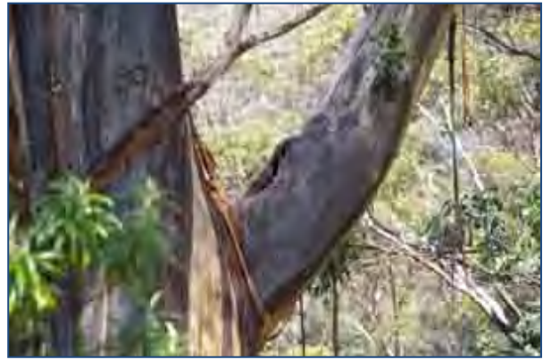
Spot the pardalote!