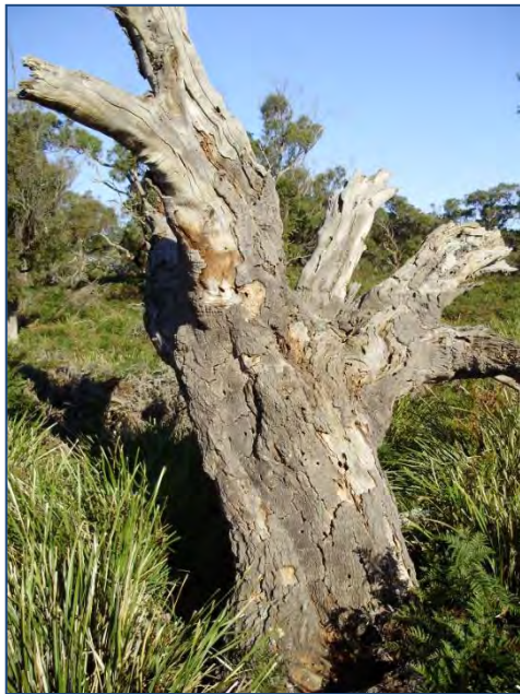
A large mature Banksia marginata stump riddled with P. australis emergence holes.

The third largest beetle in Tasmania is entirely different. The 40-45 mm Hydrophilus latipalpus is our largest water beetle. This species is a vegetarian and lives in lagoons, marshes and dams. Although common and widespread, it is rarely seen by the casual observer due to its