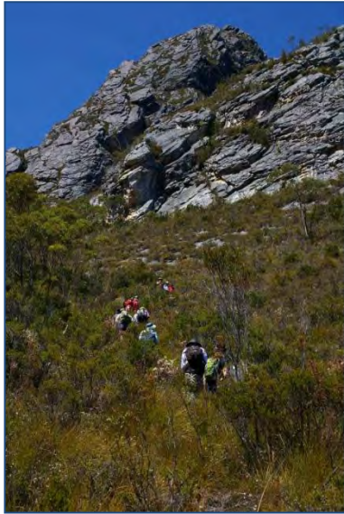
A long way to the top.....

We climbed up, the track hugging a spectacular cliff with overhangs that afforded shelter for damp and shade loving plants such as ferns and small clumps of Prionotes cerinthoides . Mosses and Milligania clung to the cliff face.