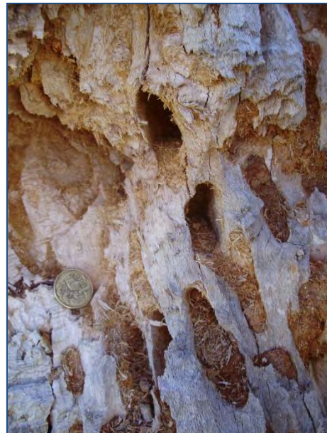
Larval bores and pupation chambers of P. australis in a large Banksia marginata