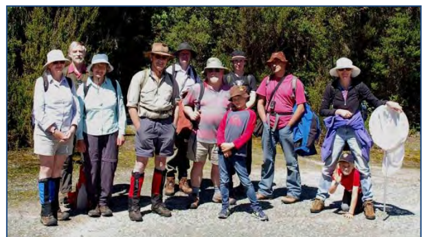
Twelve Field Nats gathered for the fray

It was pleasing to notice healthy pink Sprengelia incarnata , and white S. propinqua in blossom, and healthy Agastachys odorata near the track (these plants are susceptible to Phytophthora root rot).