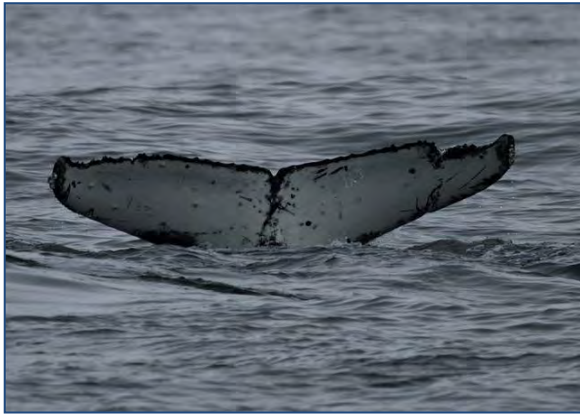
Hump backed whale

The wonders of modern digital cameras are certainly improving our ability to identify more distant birds as proved by Ian May when he managed a shot of a distant low flying bird. On blowing up the image, it could clearly be seen to be a Gould's petrel, later followed by another bird of the same species.