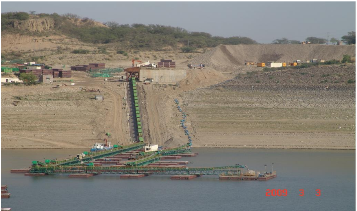
Intake Toe Weight on Upstream of Intake Embankment: Under-Water Filling is in Progress