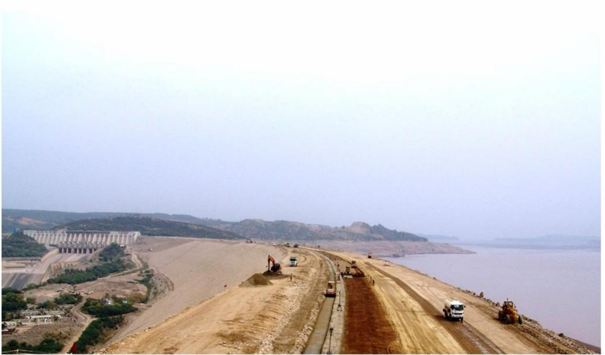
Main Dam: Filling Works are in Progress