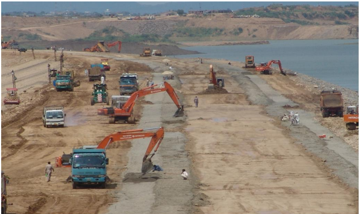
Jari Dam: Filling Works are in Progress