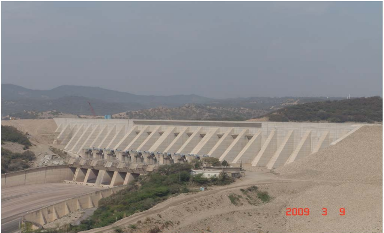
General View of Main Spillway