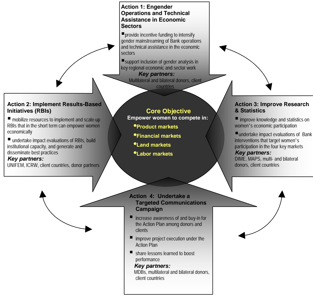
Figure 2. Four Action Areas to Address the Plan's Objectives

To address this objective, this Action Plan would commit the Bank Group to working in four action areas (Figure 2):