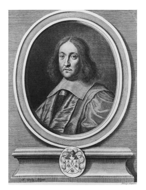
Fig. 1 Pierre de Fermat

The aim of this paper is to relate something of what happened in the three-and-a-half centuries between these two pronouncements, and, in particular, to describe some of the drama and the ideas connected with Wiles' proof.