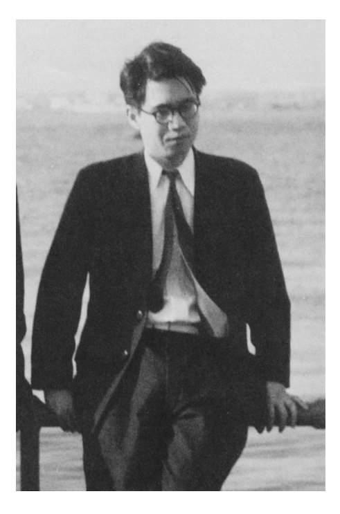
Fig. 5 Yutaka Taniyama