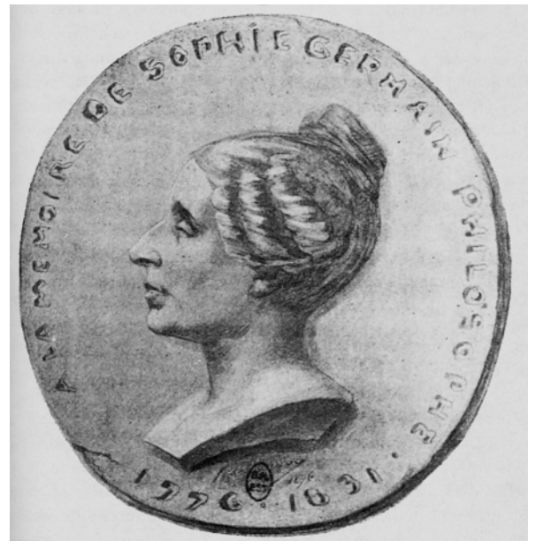
Fig. 2 Sophie Germain

The next strides in the proof of FLT were made by Legendre and Dirichlet, who, around 1825, independently established the theorem for n = 5. In 1839, Lamé proved it for n = 7. Incidentally, in 1832 Dirichlet showed that FLT holds for n = 14 but could not prove it for n = 7; the latter result, as we noted, implies the former.