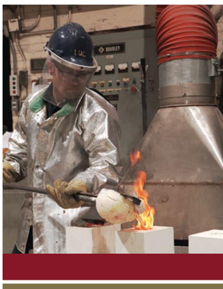
The second stage of casting when the alloy was poured into the moulds to create the Victoria Cross insignia.