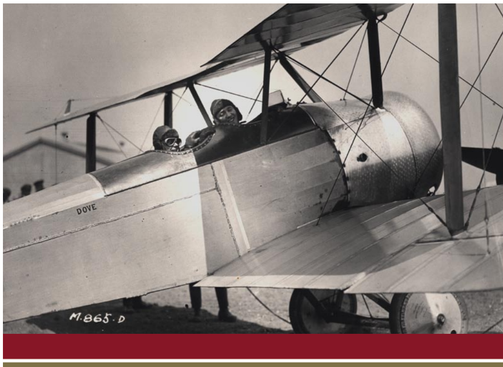
Major William George Barker in his most comfortable location, inside an airplane.

down another aircraft. Utterly exhausted by this point and severely wounded, Barker escaped, crashing his aircraft. During the mission he had raised his personal total of aircraft destroyed to 50.