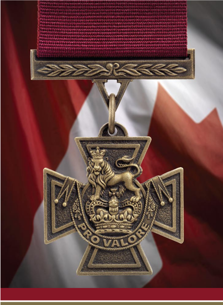
The first Victoria Cross produced in Canada.