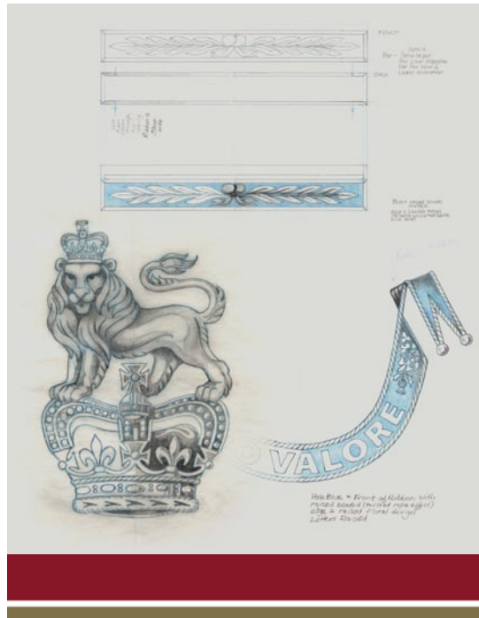
Artwork produced by Cathy Bursey-Sabourin providing details of the new insignia.

The cast insignia, rough and yellow in colour, were transferred to the Royal Canadian Mint. Each incomplete insignia needed to be finished by hand and treated to provide the dark patina of a finished Victoria Cross, thus transforming it into an award worthy of presentation.