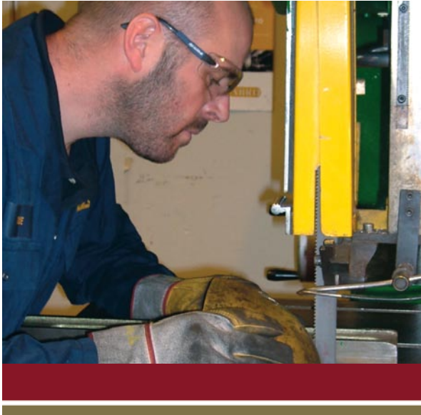
Specialist at the Defence Storage and Distribution Agency (DSDA Donnington, United Kingdom) slices a piece of gunmetal used to manufacture the British Victoria Cross.