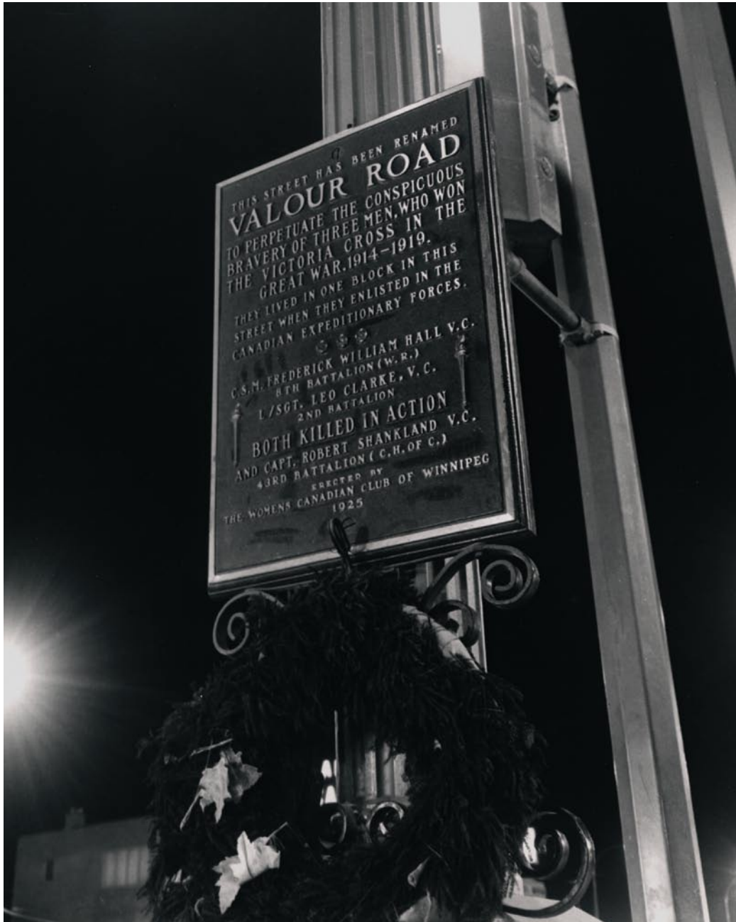
The memorial plaque erected by The Womens Canadian Club of Winnipeg in 1925 renaming Pine Street “Valour Road” in Winnipeg.