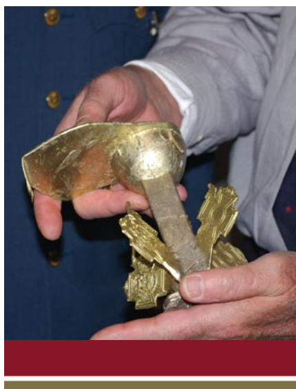
The casting tree after demoulding with four Victoria Crosses still attached.