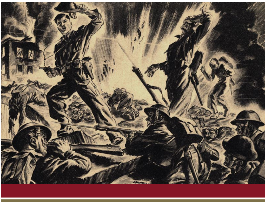
An unknown artist's depiction of Lieutenant-Colonel Charles Cecil Ingersoll Merritt's heroism at Dieppe in August 1942.

The next man in a Canadian uniform to earn the Victoria Cross did so in Italy. Captain Paul Triquet, a company commander with the Royal 22e Régiment, led his men and a handful of Canadian tanks against the hamlet of Casa Berardi on 14 December 1943. Casa Berardi was an enemy strong point protected by firing positions in a gully in front of the hamlet. Born in Cabano, Quebec, in 1910, Triquet was a professional soldier, a member of his regiment since 1927. As his troops moved forward they came under heavy machine gun and mortar fire and half the company was soon killed or wounded. Undaunted, Triquet reorganized the survivors, encouraged them and convinced them that the safest route was forward to the objective. He then led them forward as they broke through the enemy's positions and destroyed four German tanks and several machine gun nests. Having reached Casa Berardi, Triquet knew the inevitable German counter-attack was coming, so he organized his men and the remaining tanks in a defensive perimeter. When the Germans attacked he dashed from position to position, encouraging his men and fighting where needed. The defence was successful and Triquet and his men were relieved the next day.