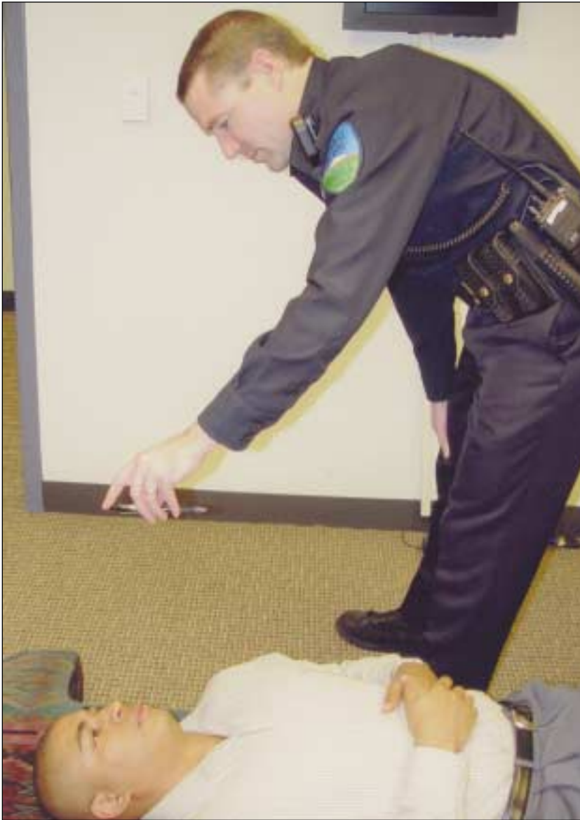
Figure 2 Demonstration of Horizontal Gaze Nystagmus test in supine posture.

tested once at each posture at each test time. Combining data from all workshops, there was a maximum of 164 evaluations at each posture at each test time.