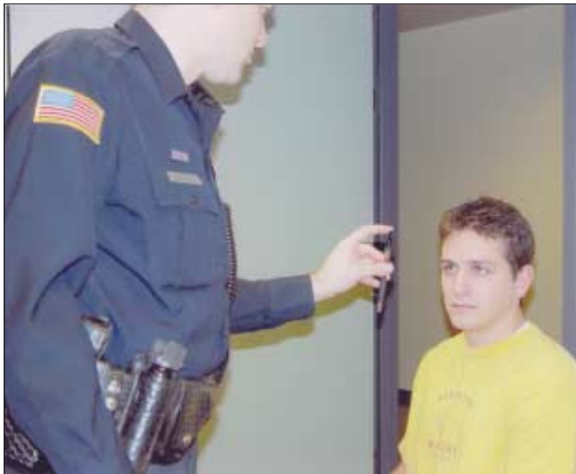
Figure 1 Demonstration of Horizontal Gaze Nystagmus test in seated posture.

All subjects were of legal drinking age and acknowledged varying levels of experience with drinking alcohol. None of the subjects reported fatigue, presence of any health conditions, or use of any medications that precluded participation in the study. Three subjects at two workshops were unable to complete the testing; nonetheless, their data for the portions completed are included in the analyses we discuss here.