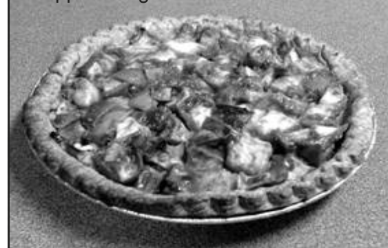
Apple Mango Pie

Go to www.goodsearch.com or www.goodshop.com and enter American Vegan Society as the charity you want to support.