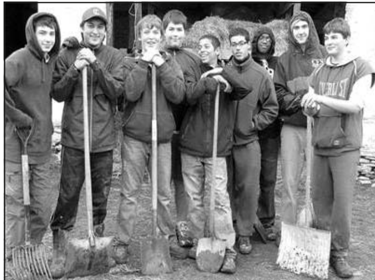
In the light drizzle of a chilly fall day, the teens concluded together, "It's a great place. You're gonna get dirty. Pack extra socks. It's fun no matter how the weather is."