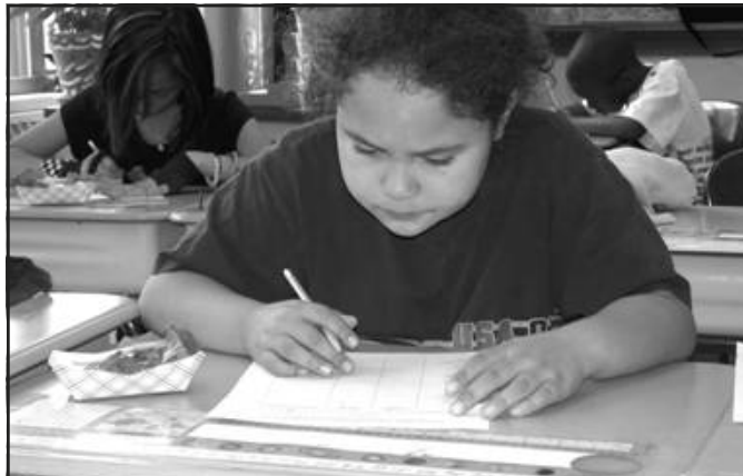
Students from the Fresh Fruit and Vegetable Program report that they miss their fruits and vegetables when they are home or on vacation. This student enjoys munching on raw bok choy and broccoli while she does her work in class.

It all started when a group of people wanted to see a legislative resolution passed in New York asking school cafeterias to provide the option of plant-based entrées. California had already passed such an initiative in 2003. Hawaii had provided (1991) the model resolution (but had to wait until 2008 for such a resolution to pass there).