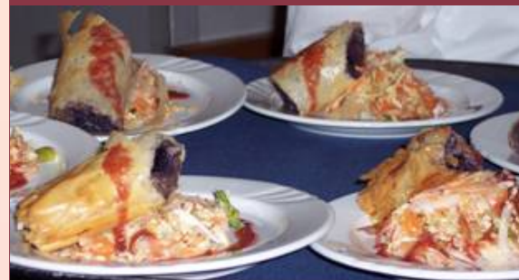
Cabbage & Shiitake Spring Rolls with Plum Sauce

Our dinner was listed as part of Meatout—a world-wide spring event celebrated this year in all 50 US states and in 31 countries. www.meatout.org