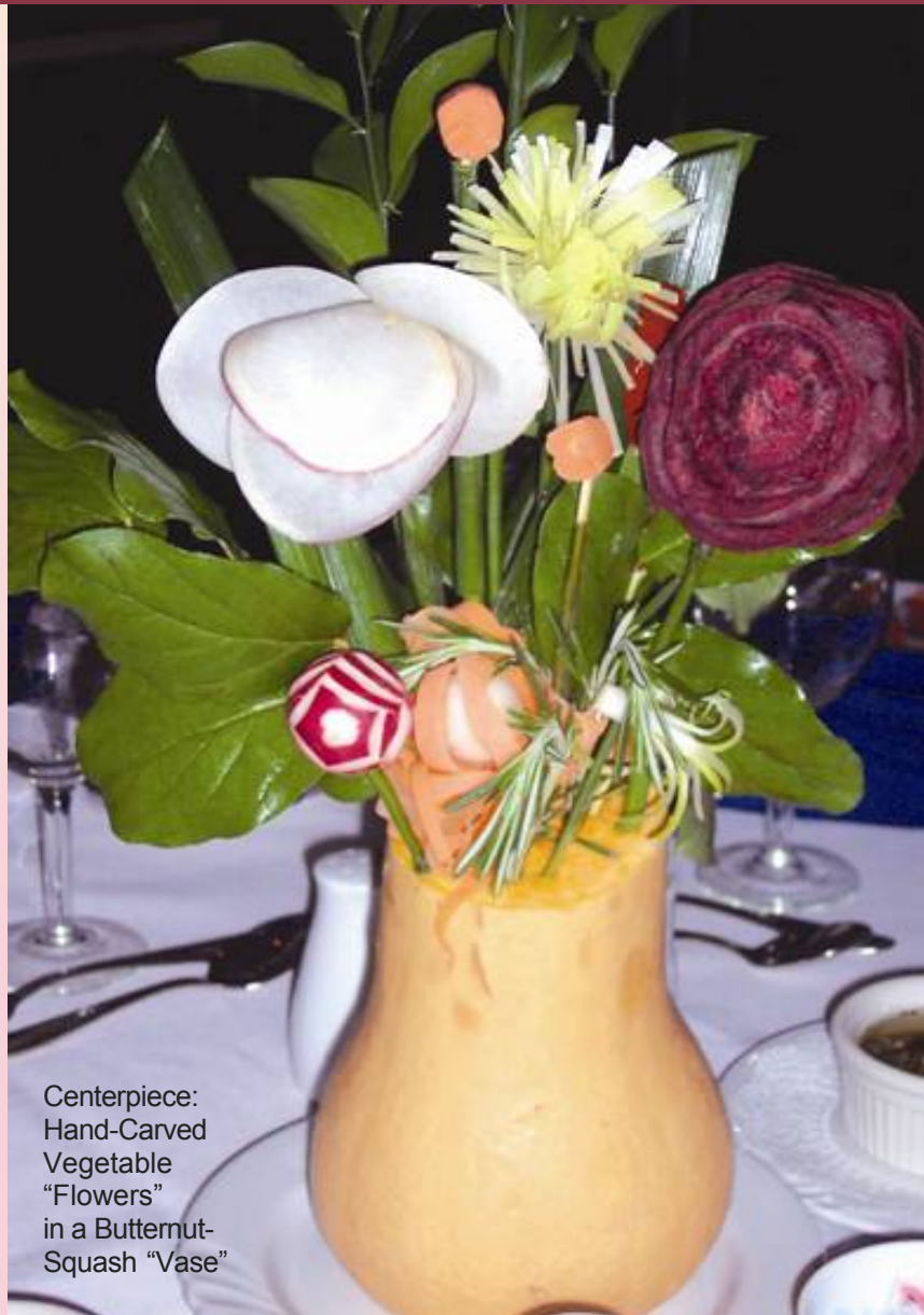
Centerpiece: Hand-Carved Vegetable "Flowers" in a Butternut- Squash "Vase"