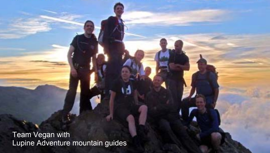
Team Vegan with Lupine Adventure mountain guides

Into the chilly pre-dawn mountain air of Snowdonia, Wales, at the horrifyingly early time of 4:15 am on Saturday June 5 2010, an all-vegan team of two girls and six guys from the Extreme Vegan Sporting Assn. departed towards a precipitous vertical ridge. After scaling Crib Goch's infamous knife-edged pinnacles, starting in darkness, they went on towards the summit of Mount Snowdon —Wales' highest peak, at 3,560 feet. Then continued from there, climbing all of Wales' fifteen 3,000 foot peaks—in the same day! They finished at the far end of Snowdonia, close to midnight.