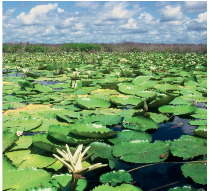
Species are the building blocks of biodiversity and provide us with essential services.

Red for Danger... Red as a 'Wake up Call?' Biodiversity loss is one of the world's most pressing crises with many species declining to critical levels. At the same time there is growing awareness of how biodiversity underpins human livelihoods.