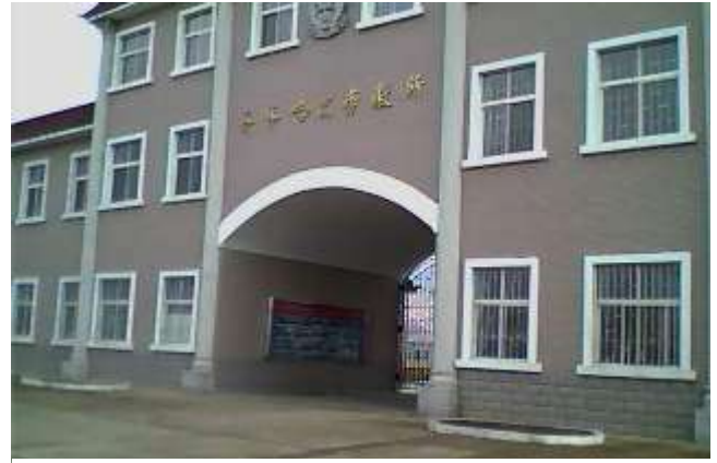
Figure 1: an RTL camp in Heilongjiang Province

Then, in the second half of 1955, the CCP launched a large-scale campaign to purge "counter-revolutionaries". On August 25, 1955, the CCCPC published the "Directives for a Complete Purge of Hidden Counter-revolutionaries"<sup>5</sup>, the first document to use the phrase "Re-education through Labor". According to the "Directives", "counter-revolutionaries…may be dealt with in two ways. One way is to send them to reform through labor ( laodong gaizhao 劳动改造) after