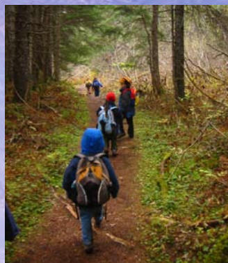
The Iditarod Trail in Girdwood is a favorite with hikers of all ages.

One hundred years after its heyday, some variation of the entire Historic Iditarod Trail from Seward to Nome is still open to the public.