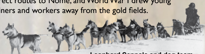
Leonhard Seppala and dog team.

By 1918 the stampede reversed itself. New winter mail contracts bypassed the fading town of Iditarod in favor of more direct routes to Nome, and World War I drew young miners and workers away from the gold fields.