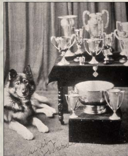
Togo, the famous lead dog for Leonhard Seppala's dog team on the Serum Run, with trophies awarded for saving Nome, Alaska.

In the winter of 1925, a deadly outbreak of diphtheria struck fear in the hearts of Nome residents. There was not enough serum to inoculate everyone and winter ice had closed the port city from the outside world. Serum from Anchorage was rushed by train to Nenana. Twenty of Alaska's best mushers and their sled dog teams relayed the serum 674 miles from Nenana to Nome in less than five and one-half days!