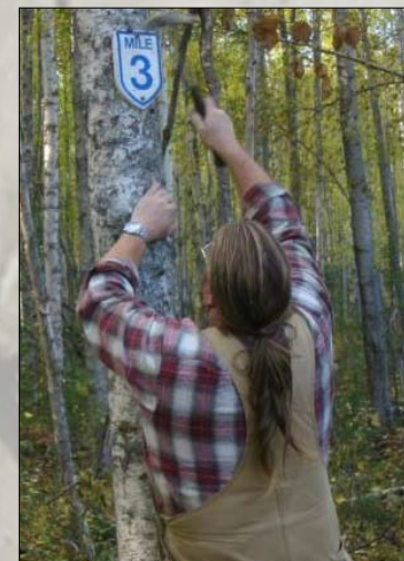
Volunteer working on the trail outside of Knik, Alaska.

Most of the historic Iditarod Trail is located on public lands managed by the State of Alaska or federal agencies (although some segments pass over private lands). No one entity manages the entire historic trail — management is guided by a cooperative plan adopted by state and federal agencies in the mid-1980s. The federal Bureau of Land Management coordinates cooperative management of the trail and is the primary point of contact for matters involving the entire trail.