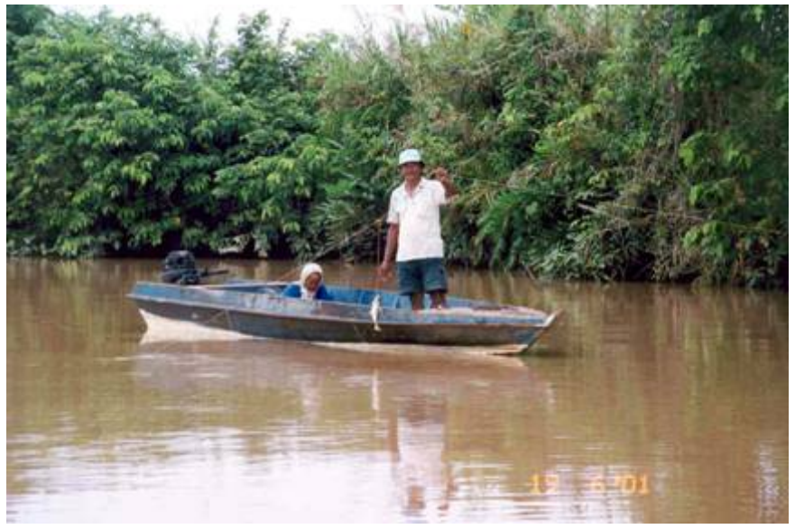
Figure 4. Catching fish using Hook & Line in Kinabatangan River, Sabah