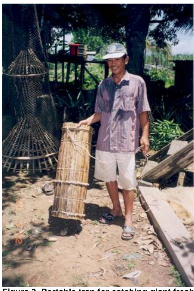
Figure 3. Portable trap for catching giant freshwater prawn in Kinabatangan river, Sabah