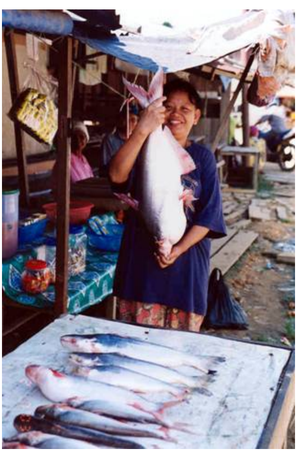
Figure 6. Selling freshwater fish Pangasius sp. at the wet market in Bukit Garam, Kinabatangan district, Sabah