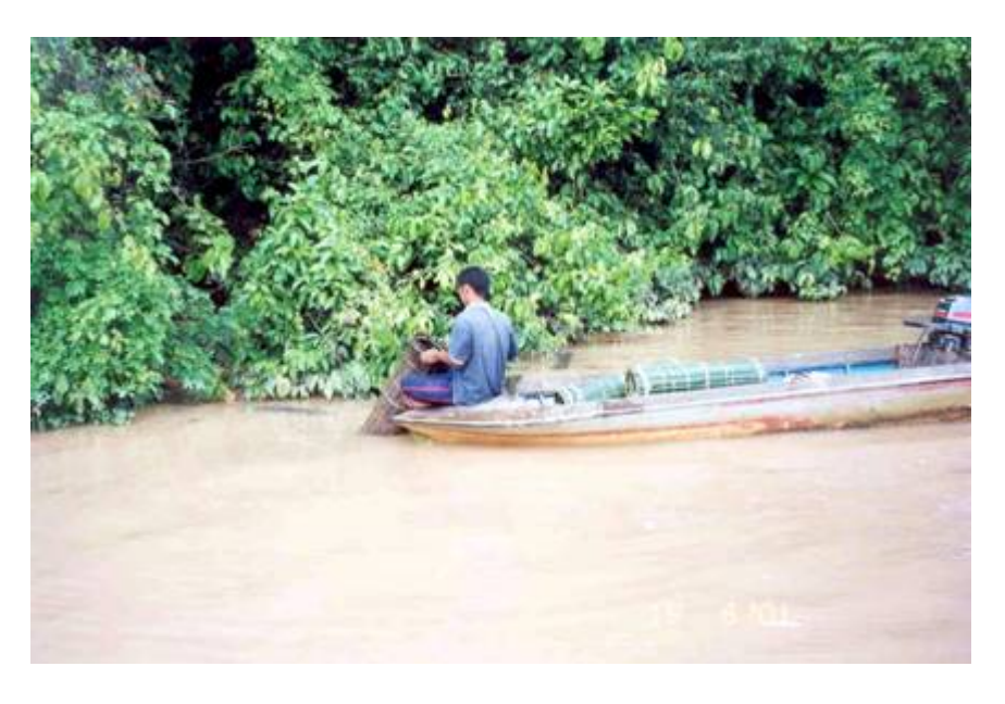
Figure 5. Fishers setting the portable traps using wooden boat powered with outboard engine in Kinabatangan River, Sabah