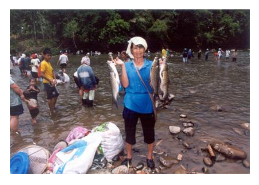
Figure 8. Harvesting fish ( Tor douronensis ) using gill net from Tuaran river, Sabah (West Coast of Sabah) managed by the villagers under Community- Based Resource Management

The catches vary throughout the year. During the rainy season, the major species caught are udang galah ( Macrobrachium rosenbergii ), patin ( Pangasius spp. ), tapah ( Wallago sp. ), baung( Mystus sp. ) and during the dry season, the major species caught are the lampam sungai ( Puntius spp. ), Lais ( Kryptopterus parvanalis ), catfish( Clarias spp. ), and pelian( Tor duoronensis ) .