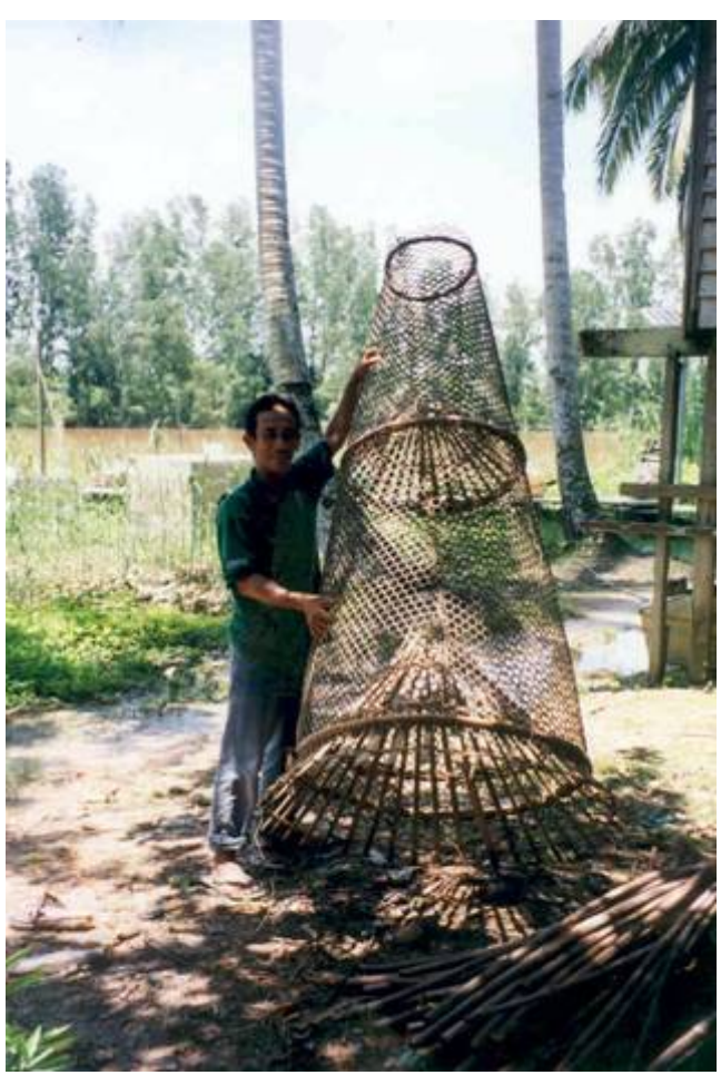
Figure 2. Portable trap for catching fish in Kinabatangan River, Sabah

Figures 2 to 8, show some of the photographs of freshwater fish species, boat and type of fishing gears/methods used in the state inland capture fisheries.