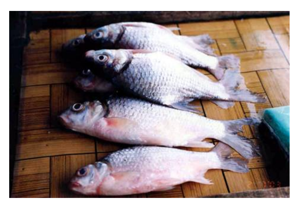
Figure 7. Putius sp. caught from Labuk Rriver in Sabah