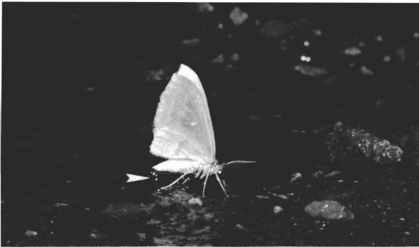
FIG. 1. Male Dyspteris abortivaria Herrich-Schaeffer, a typical discharging species, at wet soil. Arrow indicates formation of a droplet of liquid at the tip of the abdomen.

drank from the cracked bottoms of drying puddles. I observed no female of any species discharge while at soil.