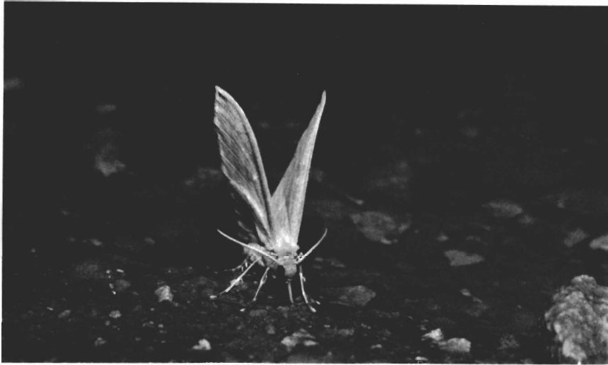
FIG. 3. Male Dyspteris abortivaria Herrich-Schaeffer showing usual position of the wings while visiting soil. Only the apical portion of the proboscis is applied to the water film.

drop size was generally proportional to body size, and when water was freely available, drops were produced at the rate of one or two per second. Suspended soil particles were also passed with the water.