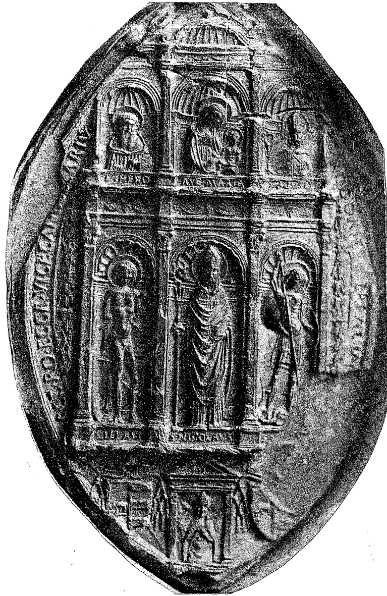
GRAND SEAL OF CARDINAL RODERIC DE BORGIA.

arm. over the words : " Ave Maria ", Hail Mary, in the larger, middle niche ; of St. Jerome, on the left, and of St. Augustin on the right side. The niches of the lower row are taller and hold the full-size relief statuettes of St. Sebastian, on the left ; of St. Nicholas, in the middle ; and of the archangel St. Michael, on the right.