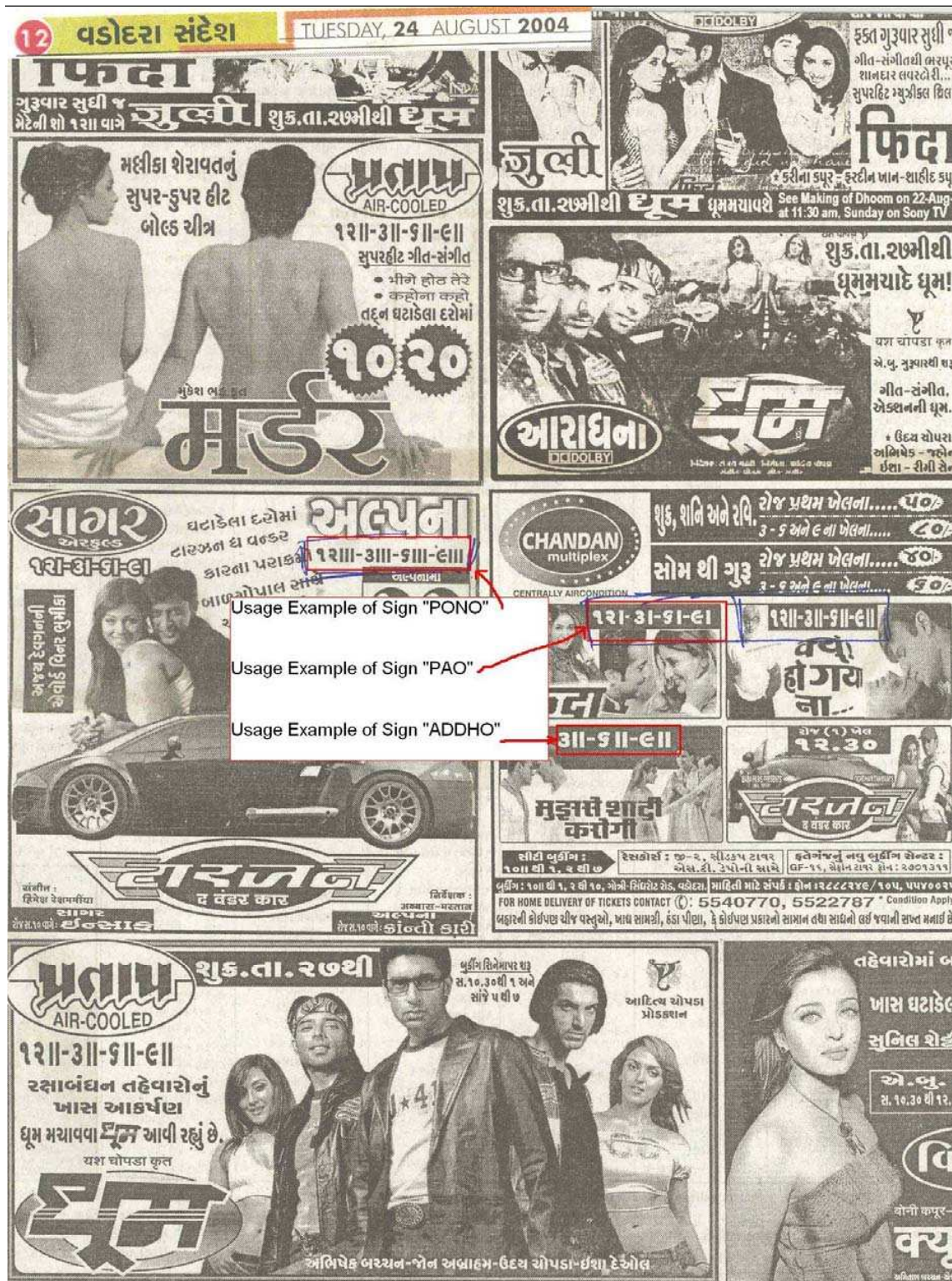
Figure 29: Annexure II from the proposal submitted by the Government of India to encode Gujarati fractions (from Government of India, 2004). The fraction signs appear in an advertisement for movie theaters printed in the Vadodra Sandesh from August 24, 2004. They represent 15 (I), 30 (II), or 45 (III) minutes of an hour. The times shown for the PAO examples are 12:15, 3:15, 7:15, and 9:15. The times shown for the ADDHO examples are 3:30, 7:30, and 9:30. The times shown for the PONO examples are 12:45, 3:45, 7:45, and 9:45.