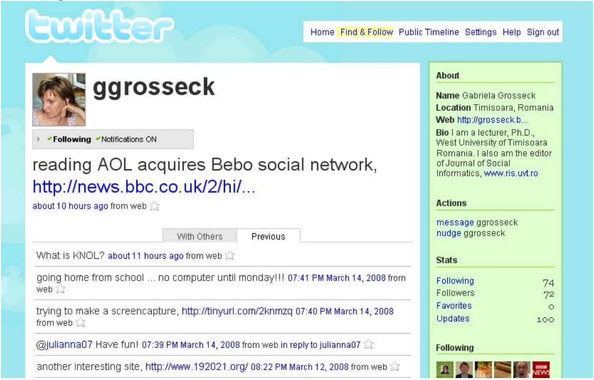
Figure 1. An example of Twitter account with updates talking about current work and educational experiments

Posts are limited to 140 text characters in length. This is why Twitter was called social networking in 140 characters.