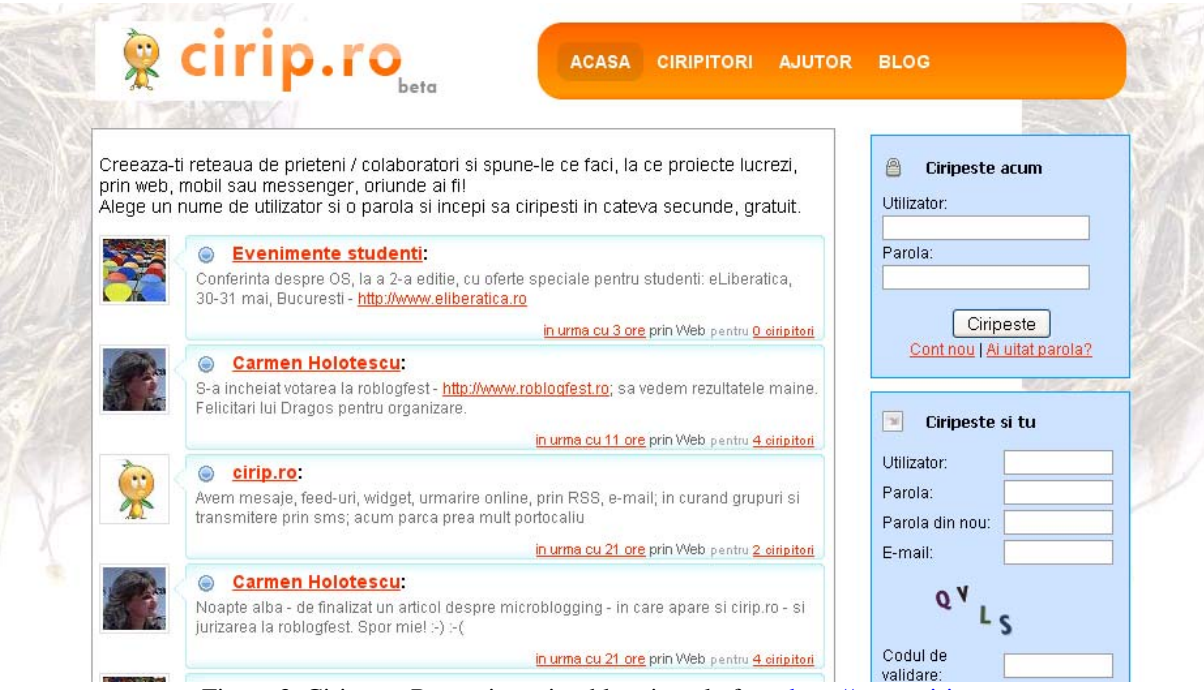
Figure 3. Cirip.ro - Romanian microblogging platform <a href="http://www.cirip.ro">http://www.cirip.ro</a>