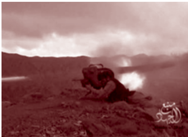
Image 10.6 MILAN anti-tank missile fired by a Taliban fighter.