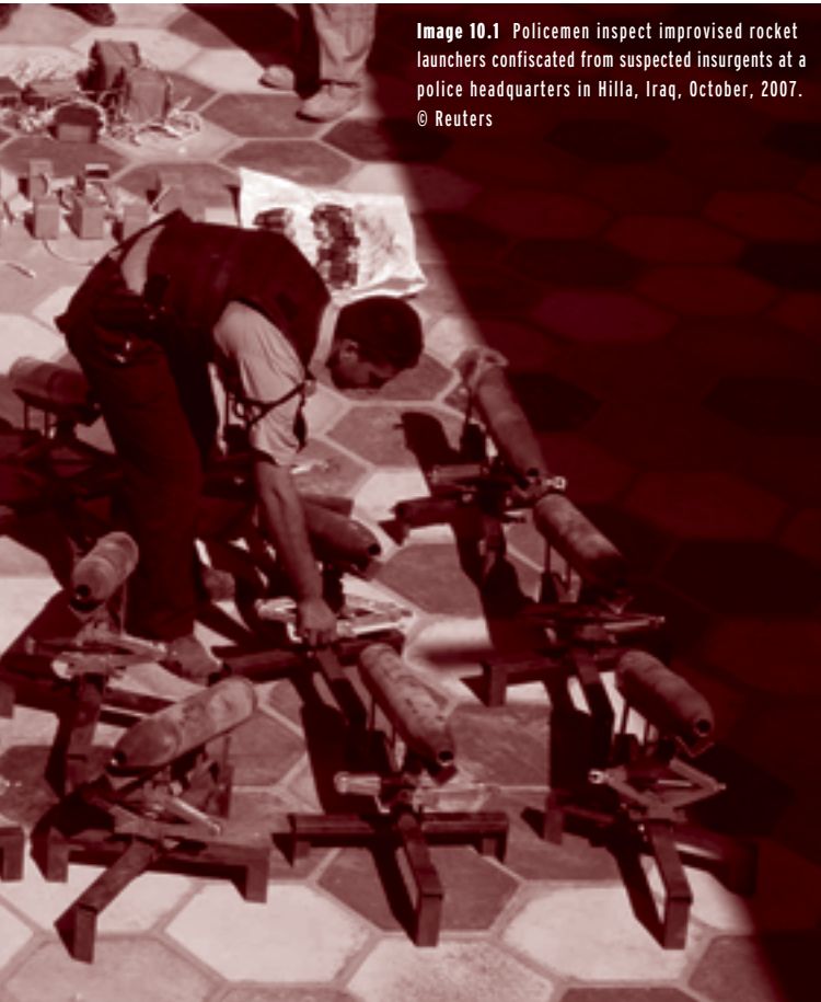
Image 10.1 Policemen inspect improvised rocket launchers confiscated from suspected insurgents at a police headquarters in Hilla, Iraq, October, 2007.

The contents of seized caches were not limited to small arms and light weapons. Dead bodies, stolen vehicles, insurgent platoon rosters, bottles of 'poison', tanks of nitrous oxide, and a kidnapped child were also discovered, as were currency and IED components from around the world. 10 These discoveries provide important clues about the age of the caches and the intentions of those who assembled them. The widespread presence of cellphones and other modern commercial technology suggests that many of the caches are fairly new. Al Qaeda propaganda, components for IEDs, attack plans, weapon training manuals, and kidnapping lists are indicative of the range of criminal and politically motivated violence pursued by consumers of illicit weapons in Iraq.