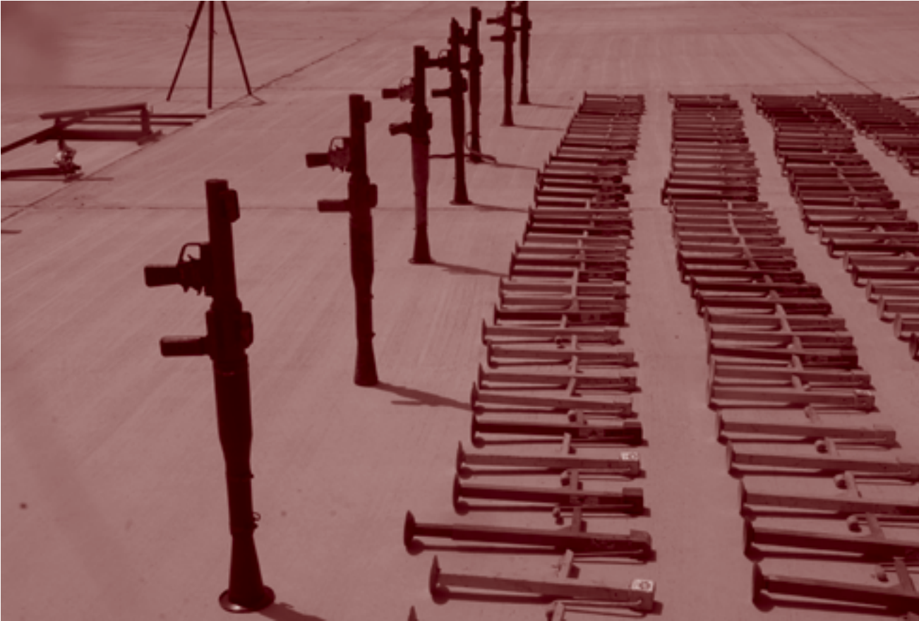
Image 10.2 Rocket-propelled grenade launchers and jacks recovered during a raid on a weapons cache are laid out at Camp Sparrow Hawk, Iraq, September 2009.

fied by model appear to be older Soviet and Chinese-designed models that are of limited utility against modern tank armour but can still be deadly when used against personnel and unprotected or lightly protected vehicles.