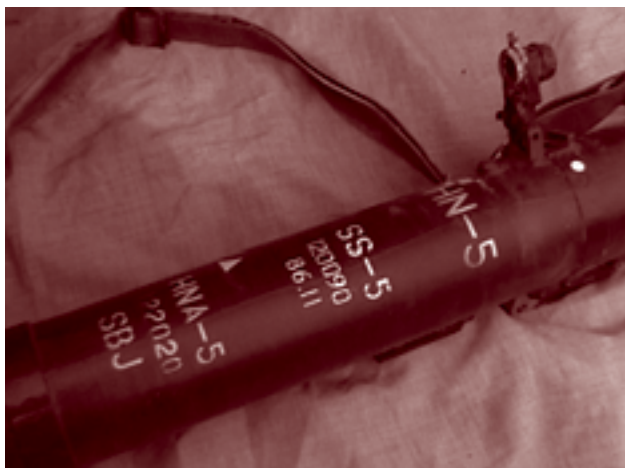
Image 10.5 HN-5 MANPADS reportedly acquired by the Taliban, 2007.