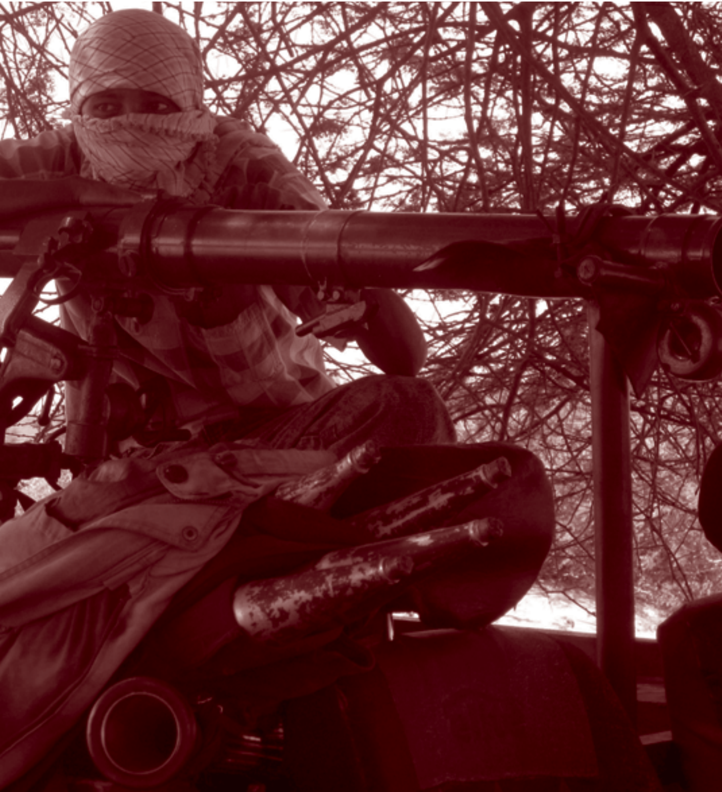
Image 10.8 A member of the armed militia for the Islamic Courts Union poses with a recoilless rifle near Mogadishu, December 2008.