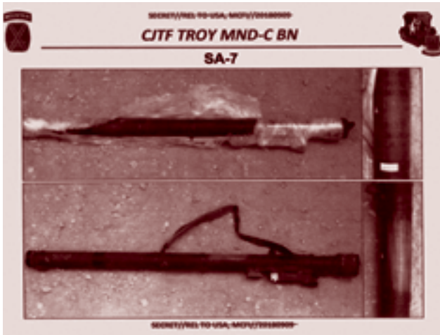
Image 10.4 SA-7b MANPADS recovered from an arms cache in Iraq.

per cache is shrinking, which may indicate that the number of MANPADS looted from government depots in 2003 and still outside of government control may be dwindling.