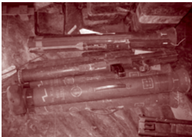
Image 10.7 MILAN anti-tank guided missiles and rocket launchers, and an M79 rocket launcher designed in the former Yugoslavia, seized from militants by AMISOM troops in Mogadishu, 2008.

Grenades have become a common feature of insurgent warfare in Somalia. In 2010, the UNSEMG recorded 155 grenade attacks (UNSC, 2011, p. 18); many of these were surprise attacks, involving the use of a single grenade against specific targets or buildings. The technique is primarily associated with al Shabaab, whose attacks largely target AMISOM and TFG troops, police, and international organizations (UNSC, 2011, p. 18).