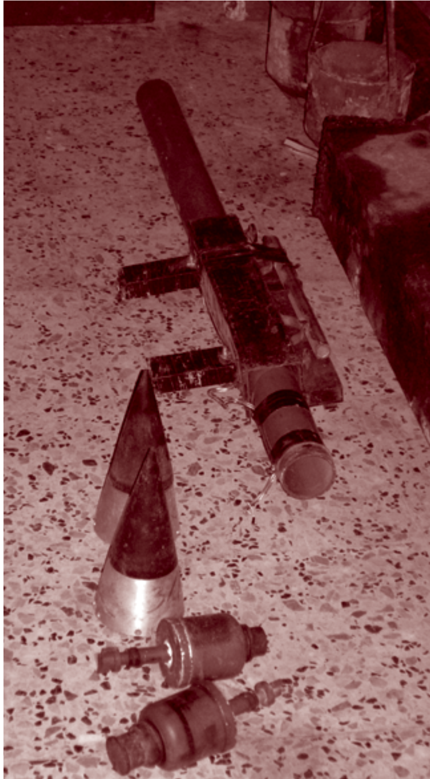
Image 10.3 A weapons cache discovered by US and Iraqi soldiers in Mosul, March 2007.

Also found in the seized caches were a limited number of single-shot, disposable rockets, most of which are early model US, Soviet, and Yugoslav weapons that are comparable in range and armour penetration to most of the available RPG-7 rounds. A single ‘AT-4’ was recovered from a cache in eastern Baghdad in June 2008. It is unclear whether the recovered item was the modern Swedish-designed shoulder-fired rocket deployed by several NATO countries or the Soviet-designed 9K11 Fagot wire-guided anti-tank missile first fielded in 1970, since the designation ‘AT-4’ is used to refer to both weapons. If the item was the Swedish rocket, it is the only contemporary Western rocket identified in the cache data.