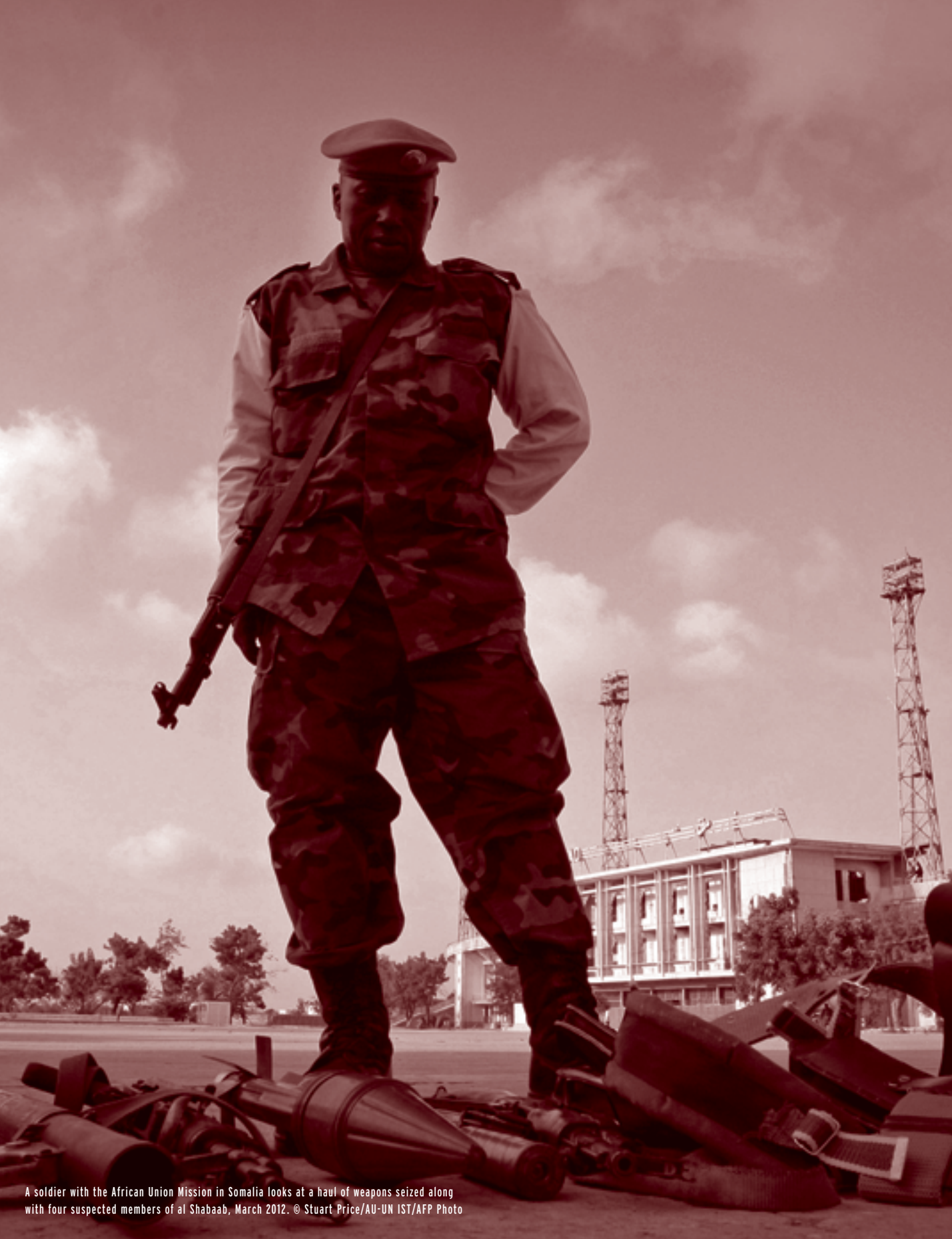
A soldier with the African Union Mission in Somalia looks at a haul of weapons seized along with four suspected members of al Shabaab, March 2012.