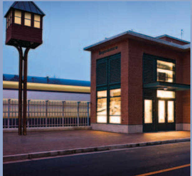
The new Columbia Street Pump Station helps reduce combined sewer overflows.

Collaboration and program alignment among Metro Vancouver and its members help prioritize maintenance and reinvestment in wastewater collection and treatment systems. Stormwater management is made more effective by better integration of stormwater management and land use planning and a commitment by GVS&DD members to implement their integrated stormwater management plans. Collaboration extends beyond Metro Vancouver and its members, and includes senior levels of government, academia and business—this fosters innovation. This plan promotes collaborative forums and dialogue through the development of a learning academy for liquid waste, partnerships in research, and advisory committees.