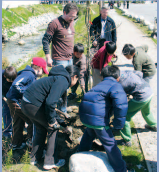
Trees improve habitat and reduce stormwater impacts, Still Creek, Vancouver.