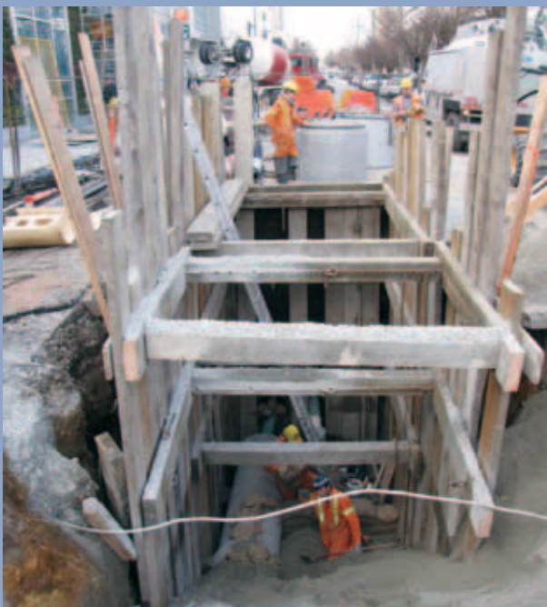
Separating combined sewers is a long-term program.