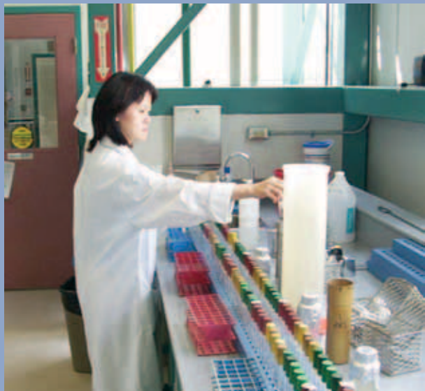
Monitoring at the Iona Island wastewater treatment plant laboratory.