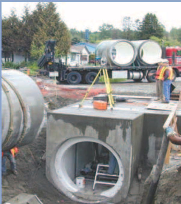
Installing Metro Vancouver trunk sewers, South Surrey.