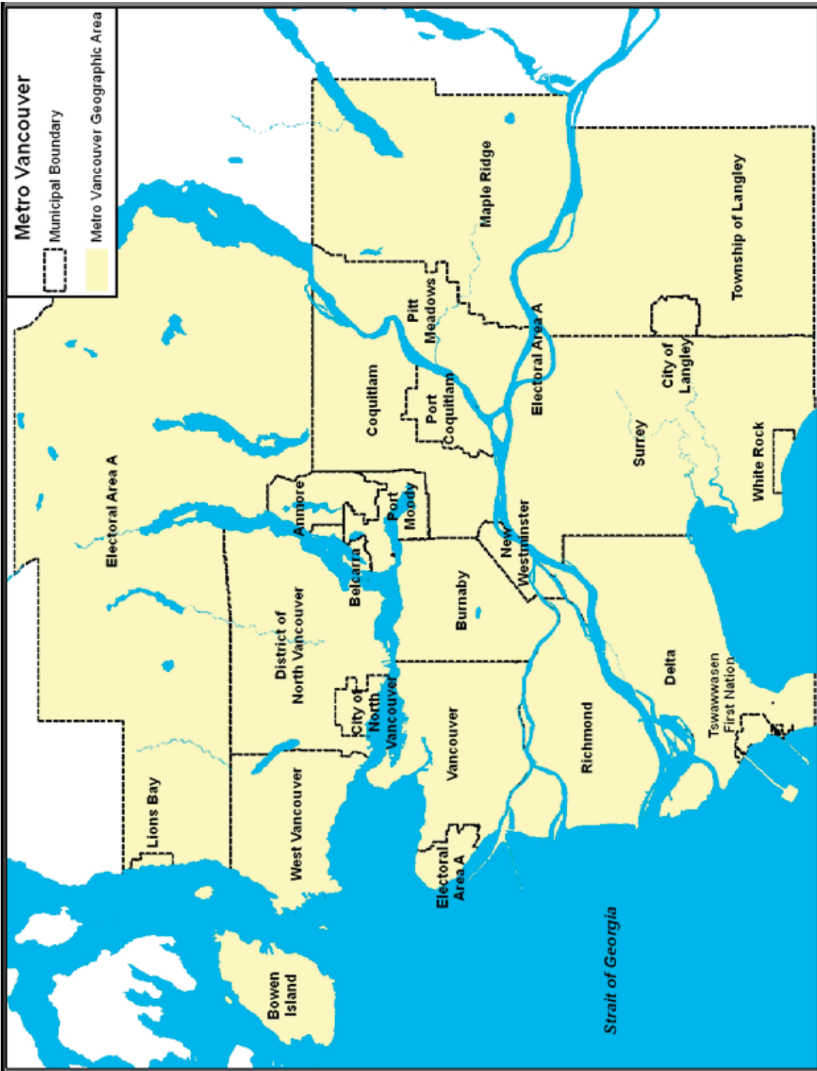
Figure 1 Metro Vancouver Member Municipalities and Electoral Area A