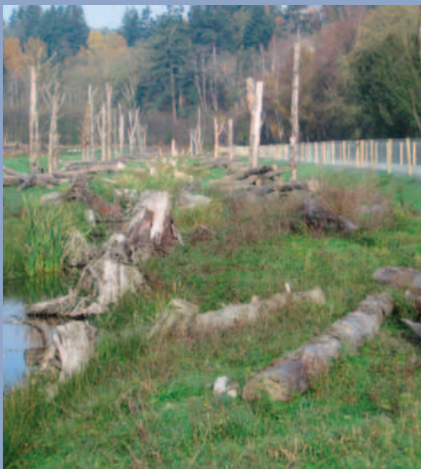
Flood management and constructed habitat, Eugene Creek, Surrey.

to ensure that Metro Vancouver's and senior governments' environmental and fiscal objectives and actions are mutually supportive and successful.