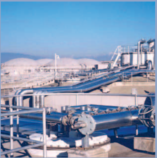
Annacis Island wastewater treatment plant provides treatment for over 1,000,000 people.

Metro Vancouver will increase enforcement of the Sewer Use Bylaw, improve source control tools and update outreach and education programs. Metro Vancouver and municipal actions will jointly seek to reduce groundwater and rainwater entering sanitary sewers over the long-term.