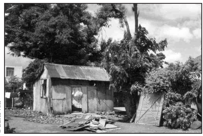
Chagossian home in Cassis, Mauritius.

This method holds that proper reparation requires the use of damage calculation assumptions that uphold the basic standards of human rights law and not standards of discrimination and inequality.<sup>23</sup> It therefore adjusts the income damage figures from the previous two methods by estimating the effect that a government's compliance with such standards would have on its people's income. Because Norway and Sweden come closest to this level of human rights compliance, this method measures the effect such compliance has had on their citizens' income and uses this effect to adjust the Chagossians' income losses under the other income damage methods.