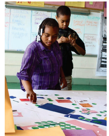
Students design their new schoolyard.