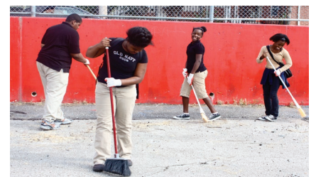
Students at William Dick School participate in a schoolyard clean-up day.