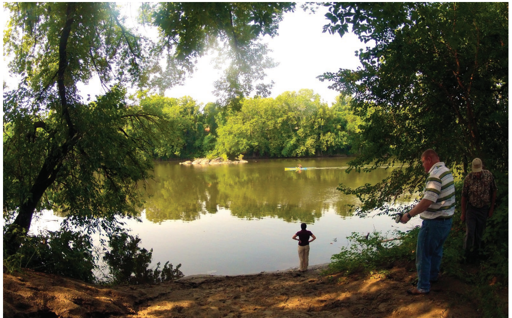
Members of the Schuylkill River Heritage Area, the PA Fish and Boat Commission, RTCA, and the Dragon Boat Association participate in a boat access site reconnaissance.

Facilitate public participation; guide improving landing and launch facilities; assist with strategic plan.