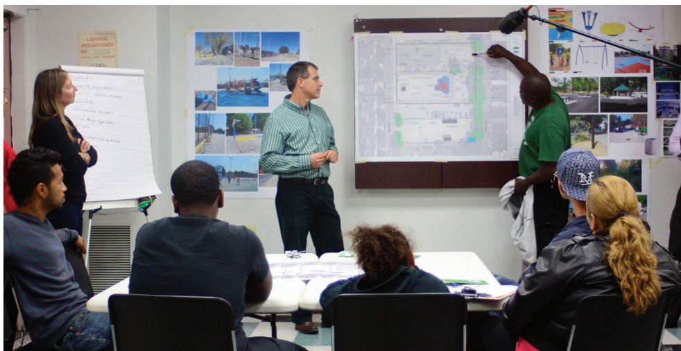
Wells Appell Architects and Trust for Public Land review the re-design of Collazo Park with the local community.

Assist with participatory design process and stewardship planning with students and community residents in schools and recreation centers.