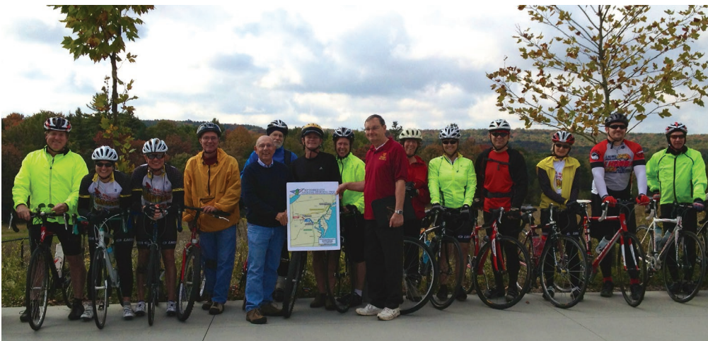
The first 9/11 Trail group bike ride, starting out at Flight 93 National Memorial, fall 2012.