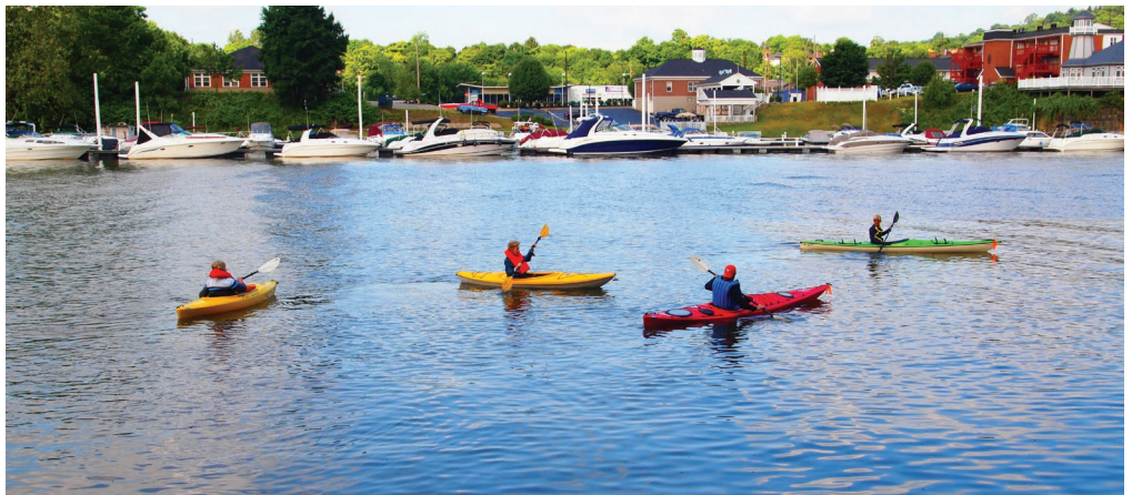
Beaver County Rowing Association holds a "Learn To Row" event on Beaver River in June 2012.

Assist with water trail planning, inventory of access sites, mapping and brochure development; assist with partnership building, public involvement, education, outreach, and fundraising.