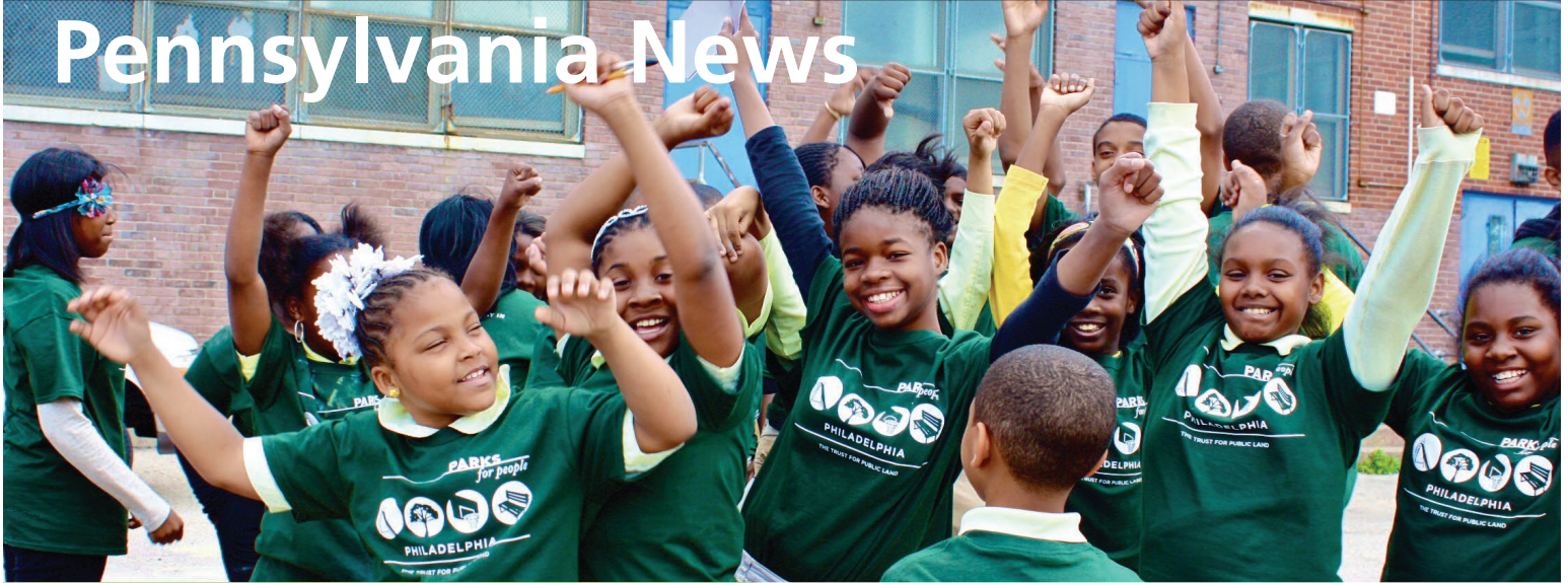
William Dick School students celebrate the launch of schoolyard greening in Philadelphia.