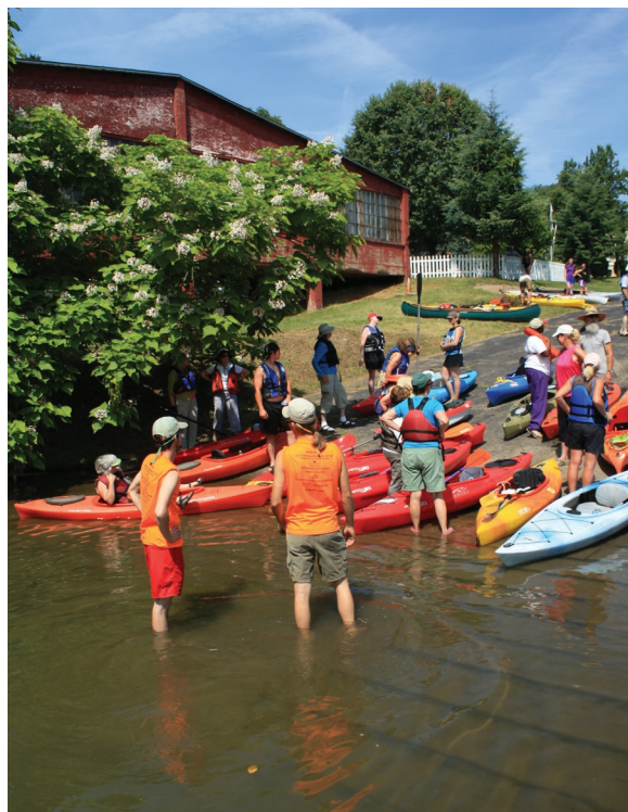
Student Conservation Association (SCA) staff help paddlers enter the Monongahela River at Rices Landing in summer 2012.