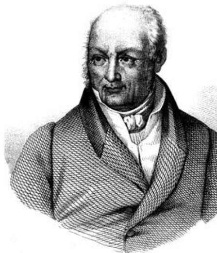
Figure 1 Gian Domenico Romagnosi. From CANTÙ (1861), frontispiece.

1791 he published his first book on law, Genesi del diritto penale , that underwent three editions during his lifetime. In the same year he became a magistrate at Trent (at that time, the city was dominated by the French) – a position he held for three years. Afterwards, he worked as a lawyer in the same city. In 1799, Austria took Trent. Romagnosi became suspect, because of his former association with the French government. He was arrested and kept captive for 15 months in Innsbruck, being acquitted and released the next year. In 1801, after the French had won the region back from Austria, Romagnosi was elected Secretary of the Higher Council of Trent.