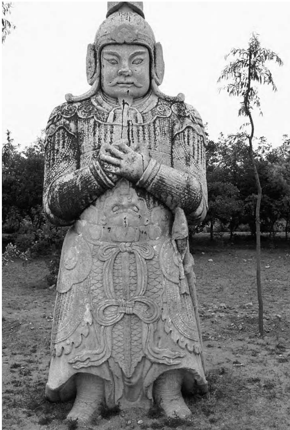
One of a pair of guardians that line the Sacred Way, a path leading to the thirteen Ming tombs in a valley outside Beijing. The guardians make sure that evil spirits cannot approach the tombs and disturb the dead.

The Hongwu emperor also left behind strict governing regulations for his own imperial family. He clearly