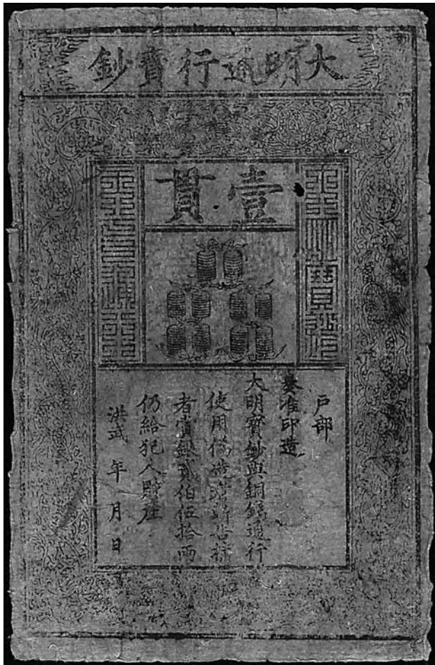
Daming tongxing baochao: early Ming dynasty bank note. Nanjing, 1375.

executive secretariat, directed by a chancellor, oversaw the central government with the six traditional ministries: Rites, Personnel, Revenue, Works, Justice, and War. Based upon the semi-autonomous regional administrative units of the Yuan, the Ming created a layer of provincial governments for the first time in Chinese history. An education system was established to teach Confucian principles and texts at a National University at the capital, with a network of schools in the prefectures and counties. A firm believer in the importance of law, the Hongwu emperor quickly ordered the creation and promulgation of a comprehensive law code.