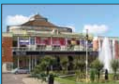
The Pavilion Theatre Westover Road