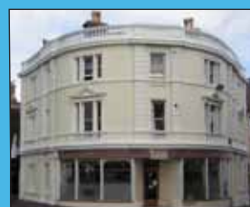
Corner House Hotel 1-3 Poole Hill