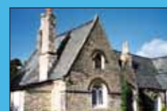
Almshouses Wallisdown Road