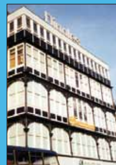
Dingles, Gervis Place