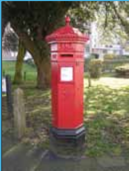
Pillarbox Meyrick Road