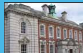
The County Court Stafford Road