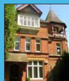
Saint Cross 23 Bodorgan Road