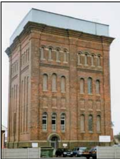
Water Tower in Palmeston Road

The majority of historic buildings within the Borough date from the Victorian and Edwardian eras, although there are a few of 18th century origin and even earlier. The special architectural or historic interest of some of the buildings in Bournemouth has been recognised as an important national asset and they have been listed. Listed building status ensures that these buildings are legally protected against unauthorised demolition, alteration or extension and that their character and setting is preserved for future generations. This leaflet aims to give a brief explanation of how this legislation affects the owners/occupiers of listed buildings.