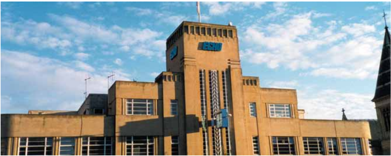
The Echo Building, Richmond Hill