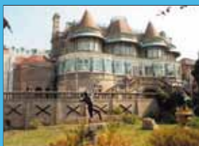
Russell-Cotes Art Gallery & Museum Russell-Cotes Road