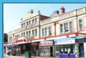
Grand Cinema 40 Poole Road