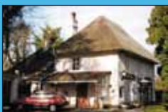
The Thatched House East Howe Lane