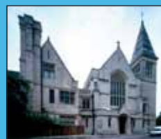
Roman Catholic Church of The Sacred Heart Albert Road