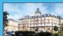
Bournemouth Town Hall Bourne Avenue