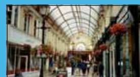
Bournemouth Arcade Old Christchurch Road