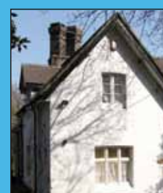
Rose Cottage Talbot Village