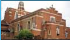
Church of The Annunciation, Charminster Road