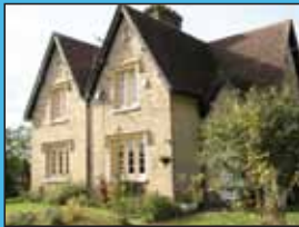
Lady Wimborne Cottages 102 & 103 Manor Farm Road