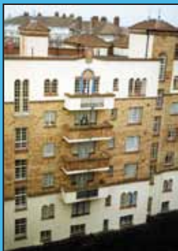
San Remo Towers Michelgrove Road/ Sea Road