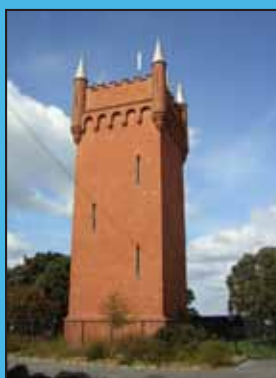
Water Tower Seafeld Road