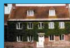
16 Holdenhurst Village