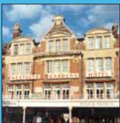
Westover Gardens Hotel Westover Road