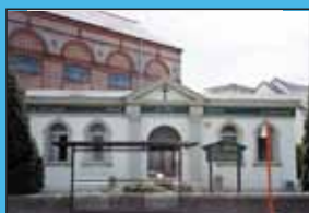
J.J. Allen Funeral Service Seamoor Road