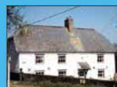
Muccleshell Farmhouse Throop Road