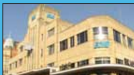
Echo Offices Richmond Hill