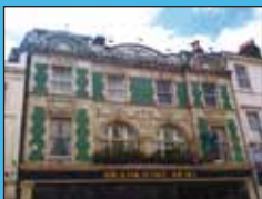
Branksome Arms Commercial Road