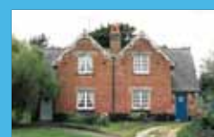
Muccleshell Cottages 1 & 2 Throop Road