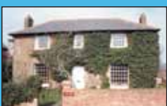
The Sanctuary Wick Lane