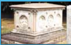
Walcott's Tomb Churchyard of St James Christchurch Road