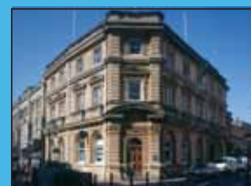
Lloyds Bank Old Christchurch Road