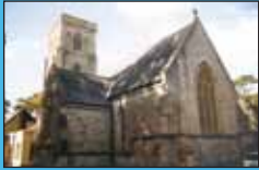
Church of St Mark Wallisdown Road