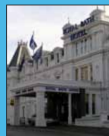
Royal Bath Hotel Bath Road