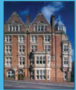
Granville Chambers Richmond Hill

Disclaimer: All information is believed to be correct at time of printing - April 2012