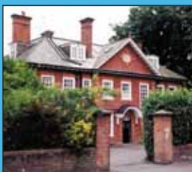
7 St Winifred's Road