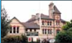
Natural Science Society 39 Christchurch Road