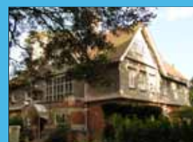
4 Portarlington Road