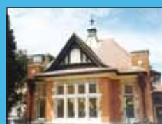
Westbourne Library Alum Chine Road