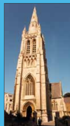
St Peter's Church Hinton Road