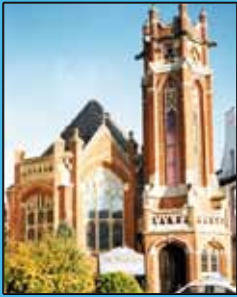
Former Unitarian Church 101 West Hill Road