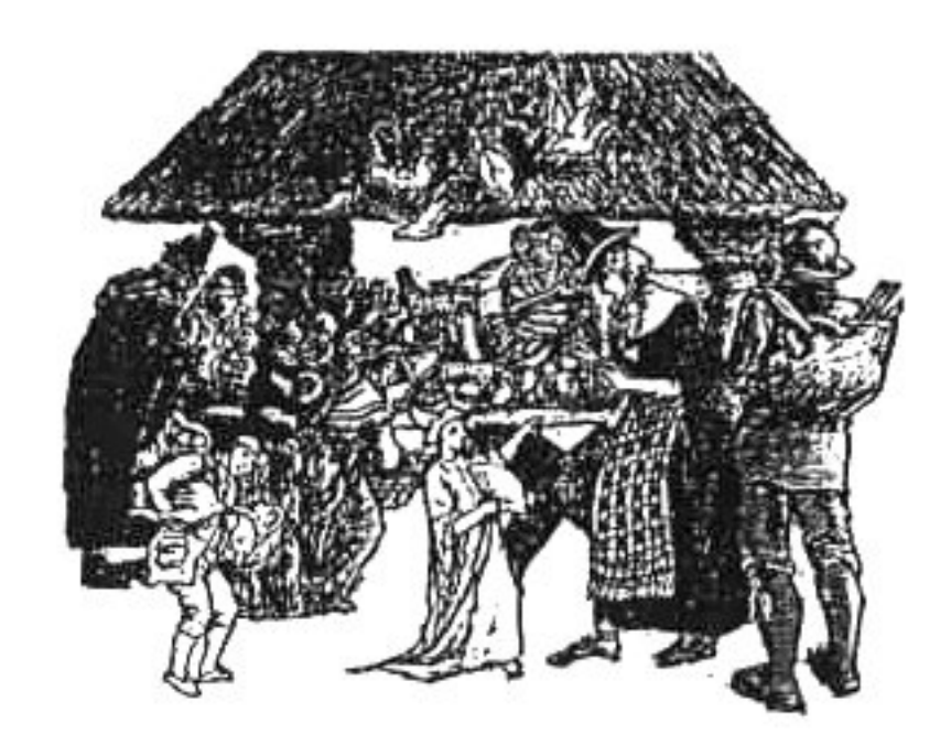
FAIRIES MARKETING AT LAUGHARNE.

That isolated cape which forms the county of Pembroke was looked upon as a land of mystery by the rest of Wales long after it had been settled by the Flemings in 1113. A secret veil was supposed to cover this sea-girt promontory; the inhabitants talked in an unintelligible jargon that was neither English, nor French, nor Welsh; and out of its misty darkness came fables of wondrous sort, and accounts of miracles marvellous beyond belief. Mythology and Christianity spoke together from this strange country, and one could not tell at which to be most amazed, the pagan or the priest.