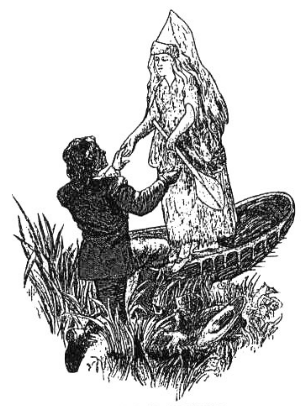
THE GWRAIG OF THE GOLDEN BOAT.

There he waited till midnight, and then slowly and solemnly dropped the seven loaves into the water, and with a sigh sent the cheese to keep them company. His persistence was at length rewarded. The magic skiff appeared; the fair gwraig guided it to where he stood; stepped ashore, and accepted him as her husband. The before-mentioned stipulation was made as to the blows; and she brought her dower of cattle. One day, after they had been four years married, they were invited to a christening. In the midst of the ceremony the gwraig burst into tears. Her husband gave her an angry look, and asked her why she thus made a fool of herself. She replied, 'The poor babe is entering a world of sin and sorrow; misery lies before it. Why should I rejoice?' He pushed her pettishly away. 'I warn you, husband,' said the gwraig; 'you have struck me once.' After a time they were bidden to the funeral of the child they had seen christened. Now the gwraig laughed, sang, and danced about. The husband's wrath again arose, and again he asked her why she thus made a fool of herself. She answered, 'The dear babe has escaped the misery that was before it' and gone to be good and happy for ever. Why should I grieve?' Again he pushed her from him, and again she warned him; he had struck her twice. Soon they were invited to a wedding; the bride was young and fair, the groom a tottering, toothless, decrepit old miser. In the midst of the wedding