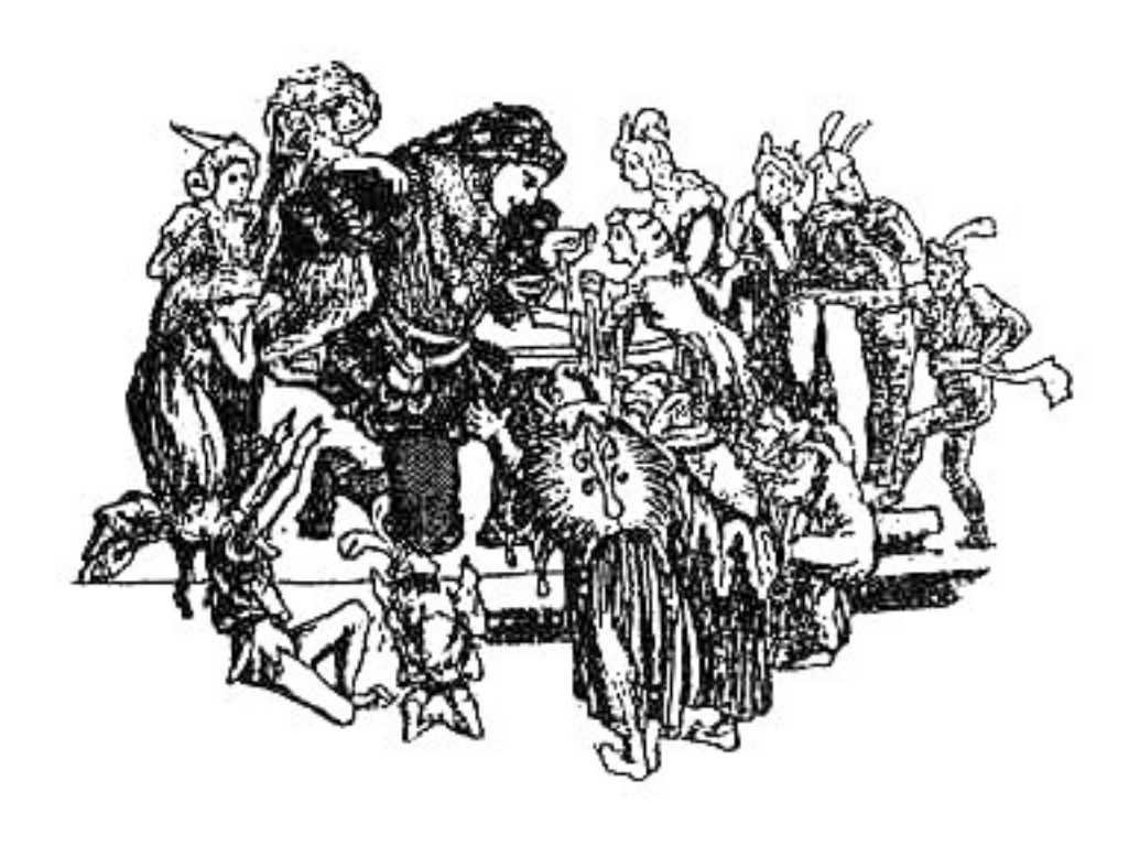
THE FATAL DRAUGHT.