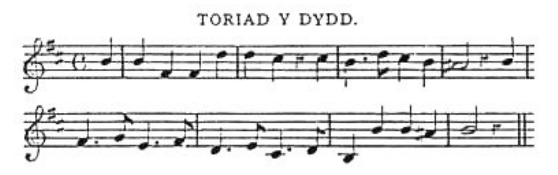
Chapter XI. Origins of Welsh Fairies

Superstitions of this class are widely prevalent among Aryan peoples. The 'Arabian Nights' story of the old rogue whose money turned to leaves will be recalled. In Danish folk-lore, the fairy money bestowed on the boors turns sometimes to pebbles, and sometimes grows hot and burns their fingers, so that they drop it, when it sinks into the earth.