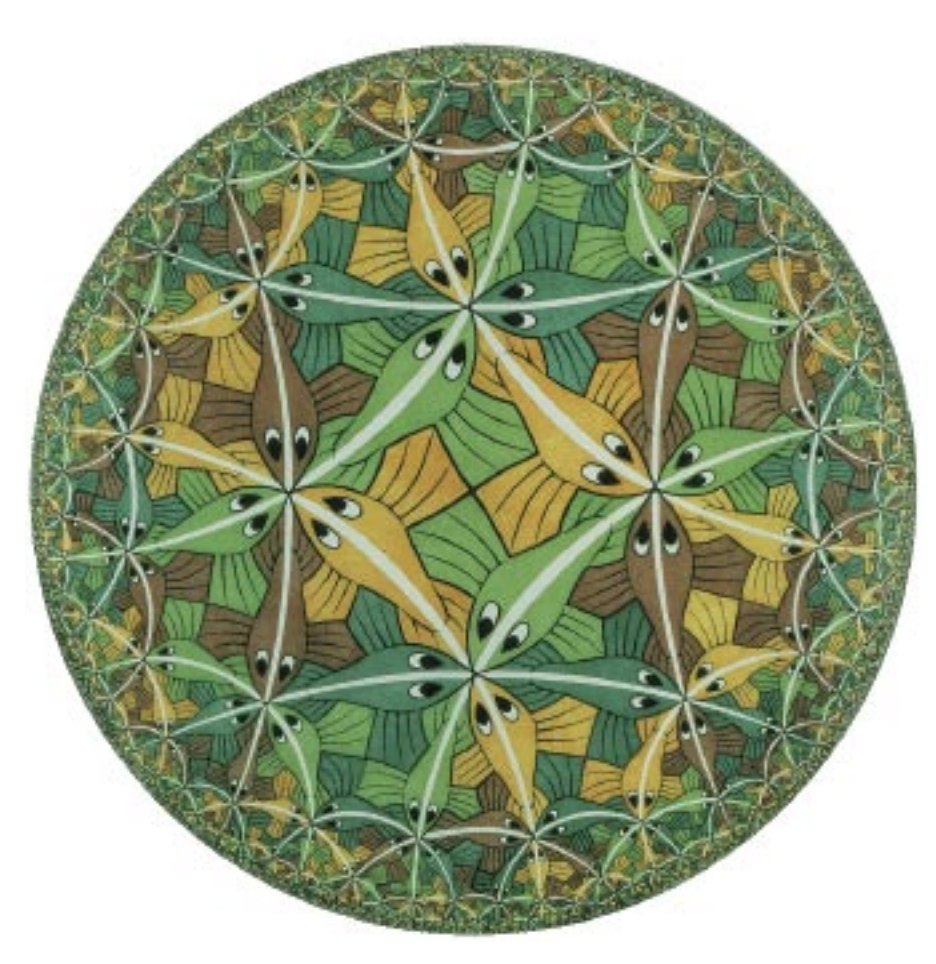
HYPERBOLIC SPACE is depicted in this M. C. Escher drawing (above). Each fish is actually the same size, and the circular boundary is infinitely far from the center of the disk. The projection from true hyperbolic space to this representation of it squashes the distant fish to fit the infinite space inside the finite circle. Drawn without that squashing effect, the space is wildly curved, with each small section (below) being somewhat like a saddle shape with extra folds.

ALL OF US are familiar with Euclidean geometry, where space is flat (that is, not curved). It is the geometry of figures drawn on flat sheets of paper. To a very