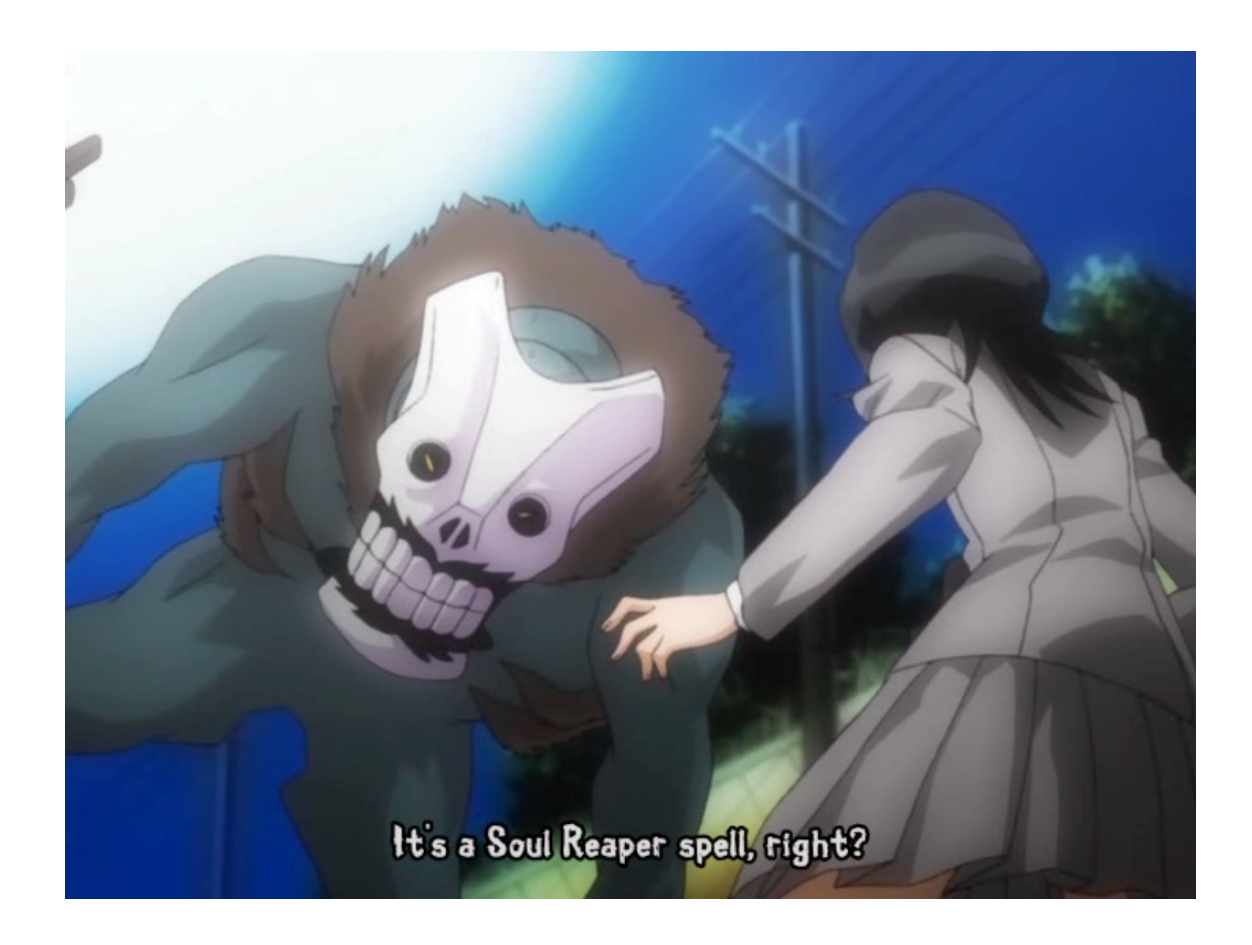
IMAGE 5: Bleach Episode 4, Anime-Keep, TV Tokyo Broadcast, Created by Kubo Tite

Many fansubs use different fonts in order to convey information about a character or some sort of on-screen activity. As discussed, this innovative subtilling may even surpass the techniques used by licensed anime distributors. Here, the subtilled speech comes from the evil character on the left (a "Hollow") and is in an appropriately spooky font for full effect.