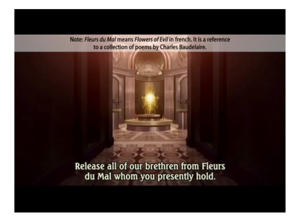
IMAGE 4: Trinity Blood Episode 1, Anime-Empire & Conclave Fansubbing

Many fansubs give translation notes or decode cultural references for the viewer. Japanese culture is very different in many respects from other cultures, and these tips help the viewer fully enjoy the anime. This frame shows that fansubbers may even give notes on obscure non-Japanese references.