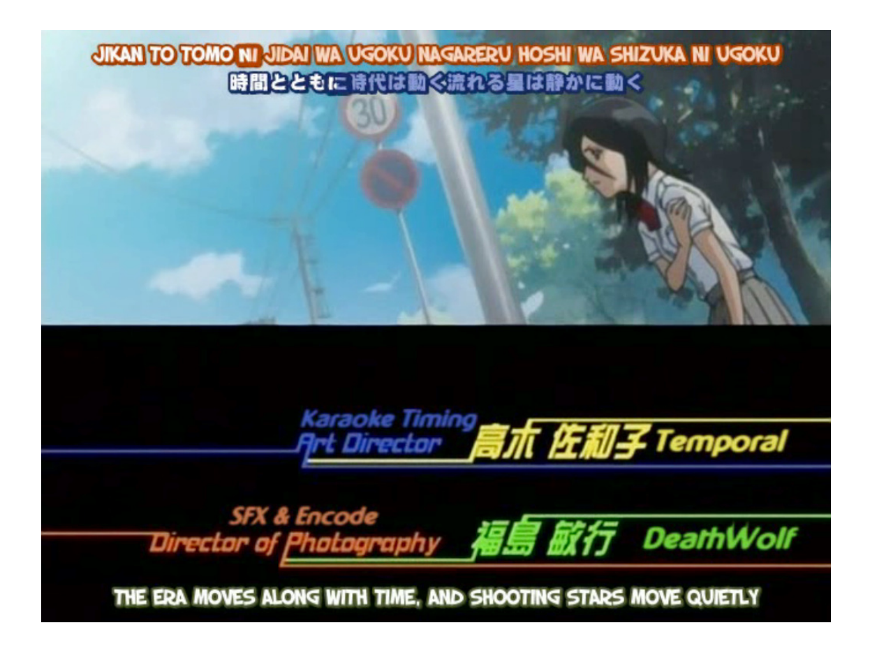
IMAGE 2: Bleach Episode 1, Anime Keep and ANBU fansub groups, TV Tokyo Broadcast, Created by Kubo Tite