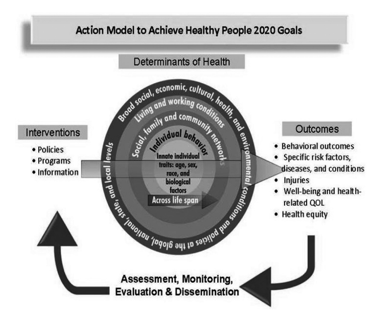
Fig.1. Scientific Advisory Committee Ecological Model Recommended as a Framework for Healthy People 2020.

Source: Secretary's Advisory Committee, Phase 1 Report, 2008.5