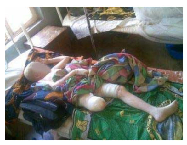
12-year old Tanzanian albino girl recovering in hospital after she was attacked and her right leg was cut off. (her facial features have been blurred to protect her identity)