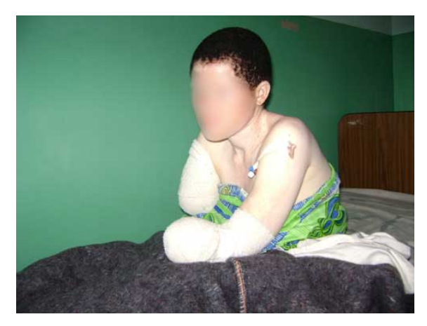
On Oct. 17/08, this albino woman from NW Tanzania was attacked and her arms were chopped off. She was six months pregnant at the time, however she later miscarried. (her facial features have been blurred to protect her identity)