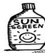
Some Sun protective Gear