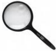
A hand-held magnifier