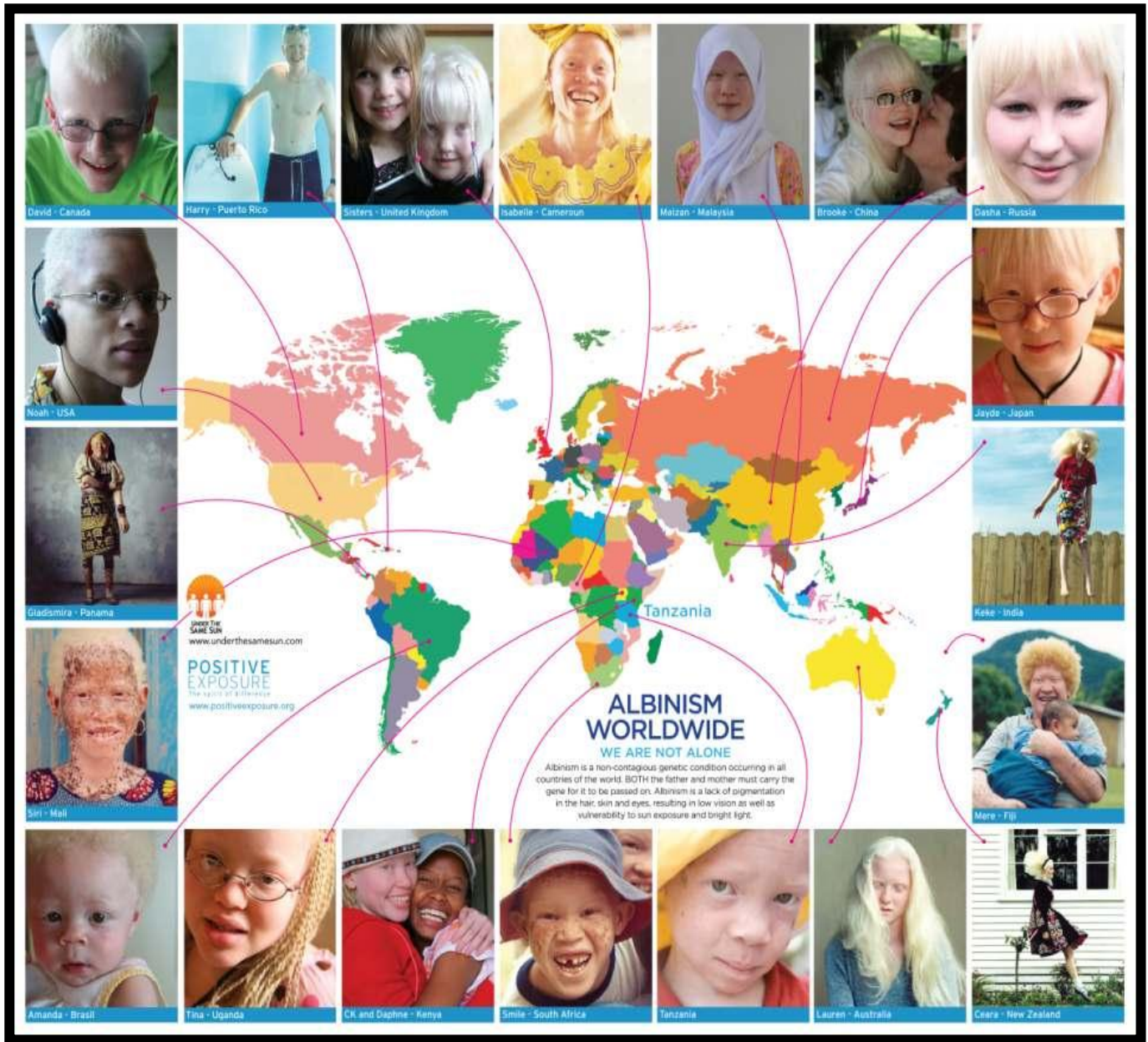
Figure 1 - Albinism Worldwide