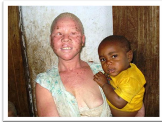
Figure 2a: A young girl from Malawi (Name Withheld). She was raped by a neighbor with AIDS due to the myth that sexual relations with a PWA can cure the disease. vi