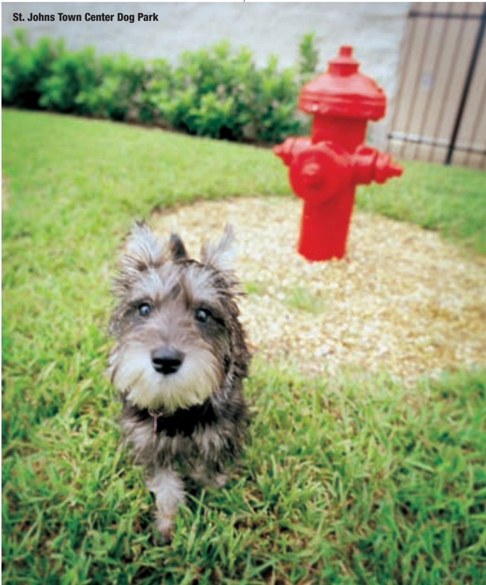
St. Johns Town Center Dog Park

Those with an itch to decorate for the holidays about two months before the actual season hits won't be disappointed when visiting the nearest Cracker Barrel Old Country Store. Christmas, Easter, Independence Day, Halloween and Thanksgiving are covered with a mélange of items that only your grandmother would appreciate. Stores in these parts also have a selection of Florida, Georgia and Florida State tchotchkes on sale. The best part: You can browse before chowing on biscuits and gravy.