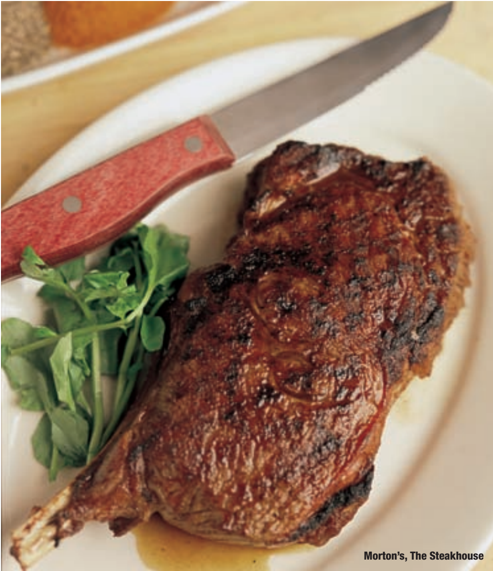
Morton's, The Steakhouse