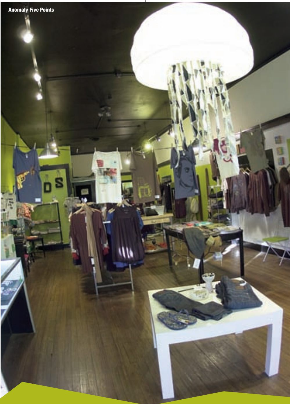
Anomaly Five Points

Everything old is new again in the Clothing Warehouse, stockers of arguably the largest collection of slightly used cowboy boots this side of the Rio Grande. The shop is packed to