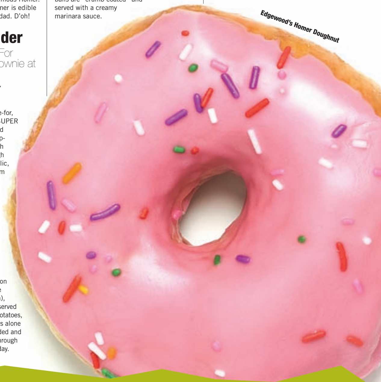
Edgewood's Homer Doughnut

The growing number of Dick's Wings franchises in and around Jacksonville probably isn't due to those who survive Dick's Secret Sauce. The Jacksonville-based, NASCAR-themed wing house prepares chicken wings 365 ways, ranging in temperature from "no heat" to the "secret sauce" (it's so hot that diners have to sign a waiver to order the stuff). Have the milk of magnesia handy.