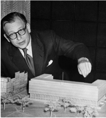
Eero Saarinen, elected 1954.

Election: 2012, FHM Affiliation at election: Paris, France Residence at election: Paris, France Career description: Musician (composer) Current affiliation: Same