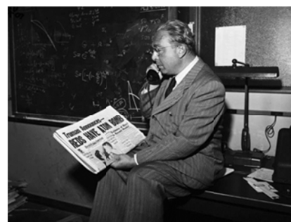
Leo Szilard, elected 1954.