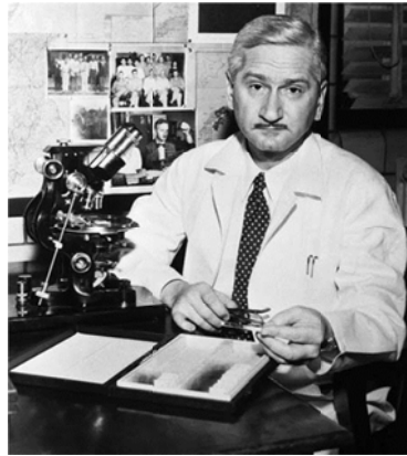
Albert Bruce Sabin, elected 1955.

Election: 2000, Fellow Affiliation at election: University of California, Los Angeles Residence at election: Los Angeles, CA Career description: Historian; Educator Current affiliation: Same