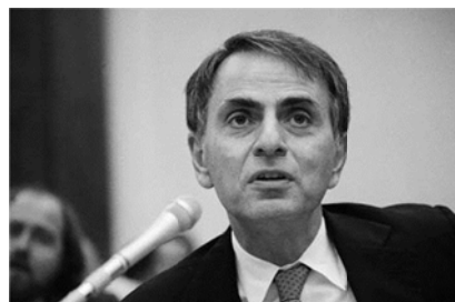
Carl Edward Sagan, elected 1978.