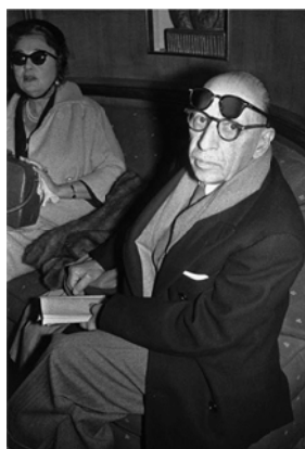
Igor Fyodorovich Stravinsky, elected 1940, FHM.

Career description: Mathematician; Applied mathematician; Educator Current affiliation: Same