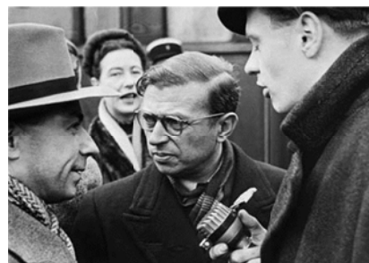
Jean-Paul Sartre, elected 1960, FHM.

Sartori, Giovanni (1924-) Election: 1975, FHM Affiliation at election: University of Florence Residence at election: Florence, Italy Career description: Political scientist; Educator Current affiliation: Columbia University