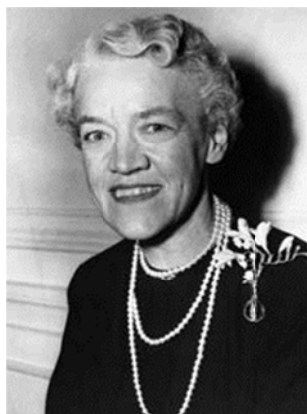
Margaret Chase Smith, elected 1952.