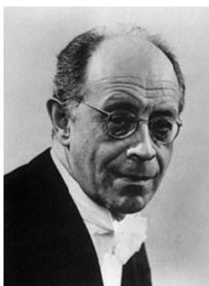
Rudolf Serkin, elected 1960.