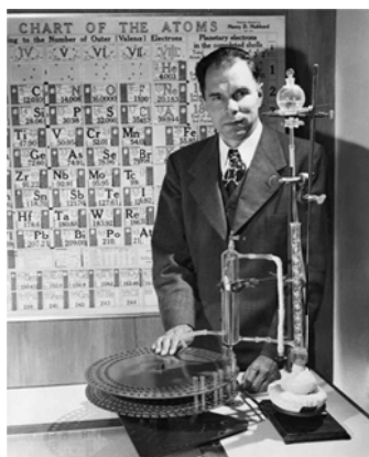
Glenn Theodore Seaborg, elected 1958.