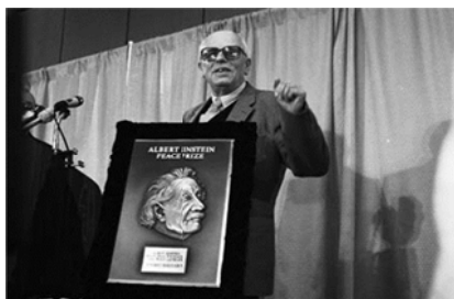
Andrei Dmitriyevich Sakharov, elected 1969, FHM.

Election: 1896, Associate Fellow Affiliation at election: New York, NY Residence at election: New York, NY Career description: Artist (sculptor)