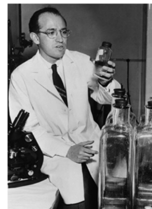
Jonas Edward Salk, elected 1966.

Election: 1969, Fellow Affiliation at election: New York Times Residence at election: New York, NY Career description: Journalist; Editor