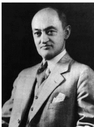
Joseph Alois Schumpeter, elected 1933.