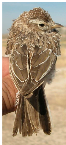
Lesser Short-toed Lark. Upperpart pattern: left adult (04-V); right juvenile (28-VI)