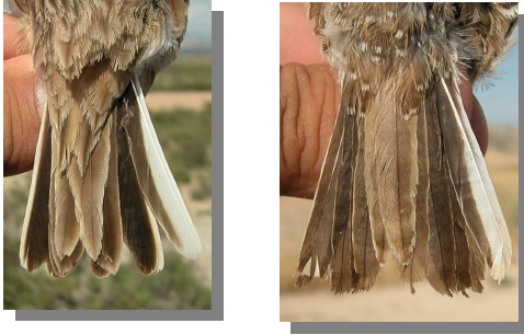
Lesser Short-toed Lark. Tail pattern: left adult (04-V); right juvenile (28-VI).