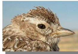
Lesser Short-toed Lark. Juvenile.