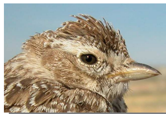
Lesser Short-toed Lark. Ageing. Pattern of head: top adult; bottom juvenile.