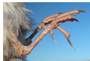
Lesser Short-toed Lark. Legs colour: left adult (04-V); right juvenile (06-VII).