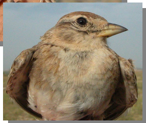
Short-toed Lark. Adult.