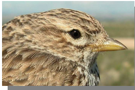
Lesser Short-toed Lark. Adult.