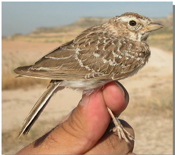
Lesser Short-toed Lark. Juvenile (28-VI)