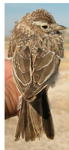
Lesser Short-toed Lark. Ageing. Pattern of upperparts: left adult; right juvenile.