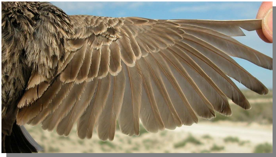
Lesser Short-toed Lark. Adult: pattern of wing (04-V).