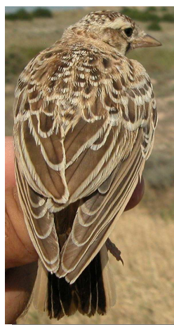
Short-toed Lark. Juvenile.