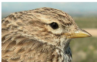
Lesser Short-toed Lark. Pattern of head and bill: top adult (04-V); bottom juvenile (28-VI)