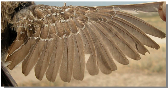
Lesser Short-toed Lark. Juvenile: pattern of wing (28-VI).