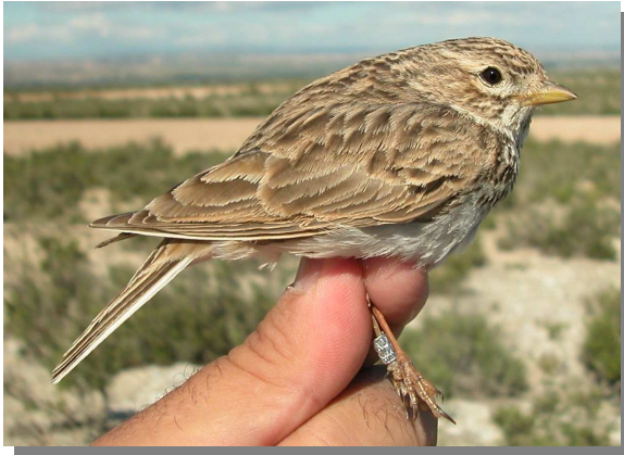
Lesser Short-toed Lark. Adult (04-V).