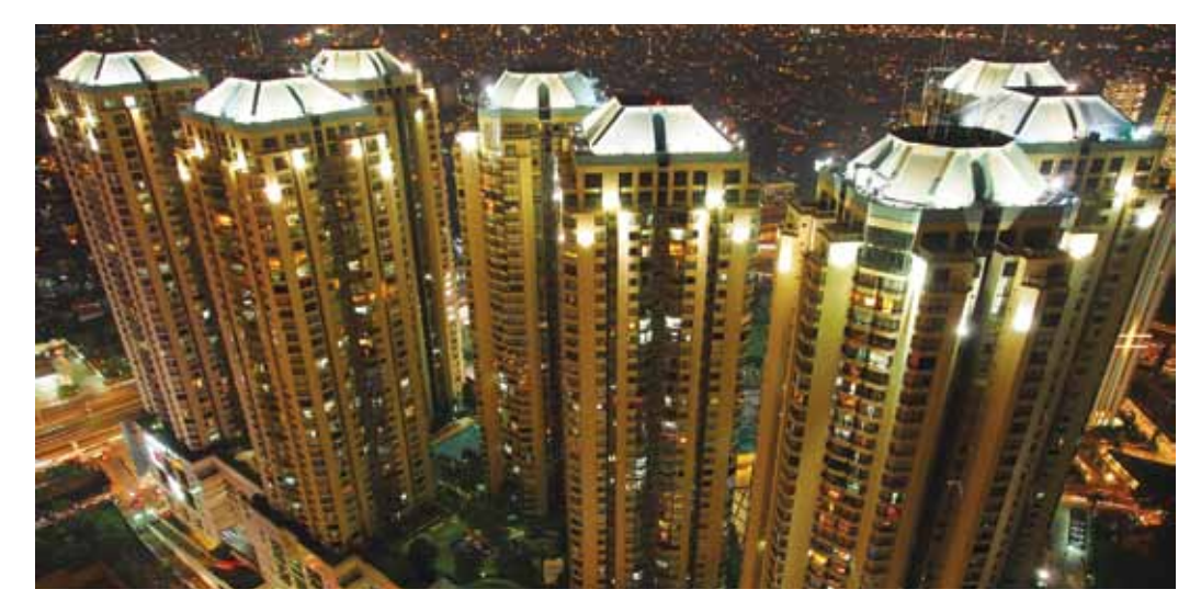
The region's economic is growing rapidly.

Over the last year, the region's financial markets have been deepened, with greater focus on capital market development and banking and insurance market integration. This has led to a strong financial intermediation in the region to support trade integration. Efforts to implement the ASEAN Framework for Equitable Economic Development which is intended to narrow the development gaps in the region have gained momentum, with new initiatives being introduced like financial inclusion. Meanwhile, negotiations for the Regional Comprehensive Economic Partnership, which will further cement ASEAN's centrality when completed by 2015, have also started.