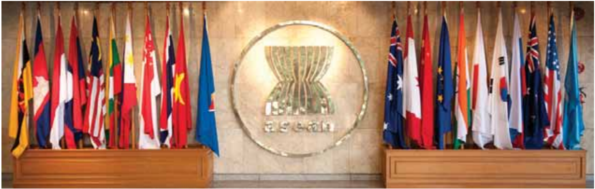
Flags of ASEAN and Dialogue Partners.

On the external relations front, ASEAN is vigorously intensifying dialogue and cooperation with its Dialogue Partners, international and regional organisations as well as with other external parties. External parties increasingly regard ASEAN as one of the most successful regional organisations, which serves as the central locomotive for peace, stability and prosperity in the region and beyond. ASEAN is actively engaging its Dialogue Partners to further enhance dialogue and cooperation with them. In addition, ASEAN is solidifying its engagement with regional and international organisations as well as international institutions and UN Specialised Agencies.