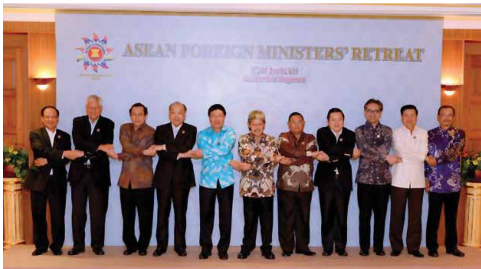
ASEAN Foreign Ministers' Retreat in Bandar Seri Begawan, Brunei Darussalam, 10-11 April 2013.