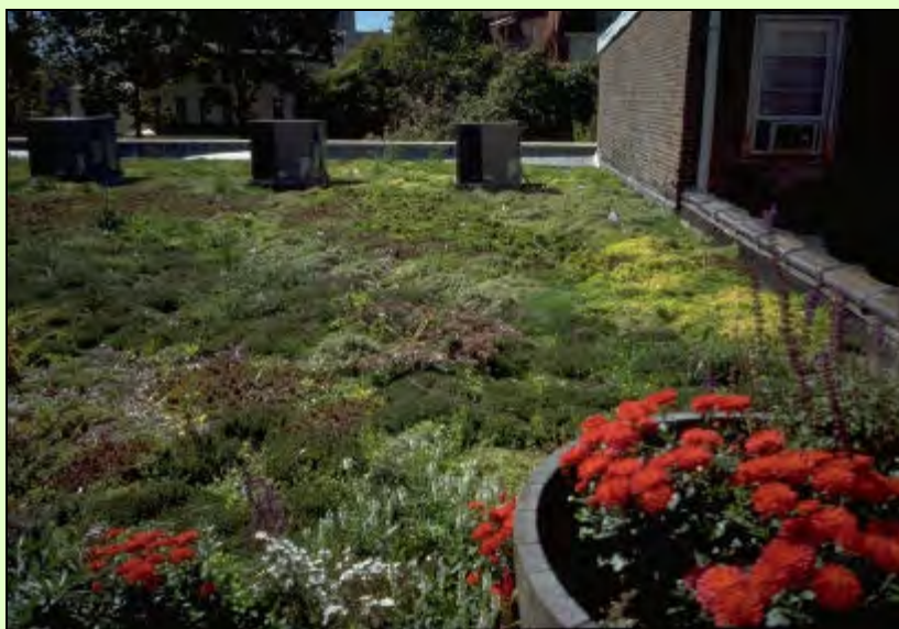
Figure 1. Fencing Academy of Philadelphia vegetated roof cover.