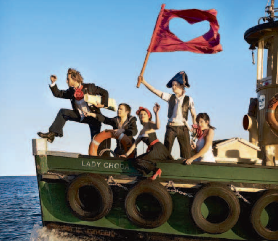
CODA are playing at this year's Newtown Festival.

With the profits from last year's festival the centre employed a community development worker who has allowed them to increase their services to the local community.